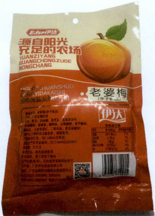
Figure 2. Unregistered EDSP Yuanziyang Guangchongzude Nongchang Meiweichuanshuo Congyidakaishi Dried Fruit in a Clear and Red Plastic Packaging (In Foreign Language)