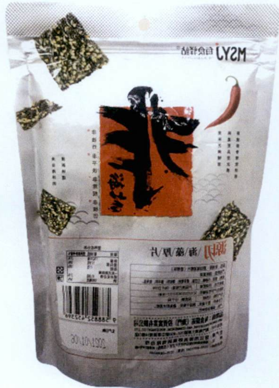
Figure 3. Unregistered MSYJ THE DELICIOUS STATION Seaweed Let's Play Flavor (In Foreign Language)