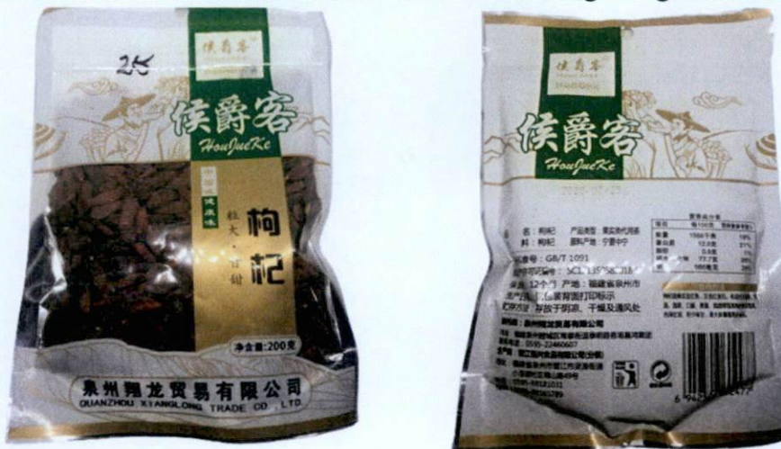
Figure 1. Unregistered HOUJUEKE in White and Gold Resealable Plastic Pouch (In Foreign Language)

The Food and Drug Administration (FDA) warns all healthcare professionals and the general public NOT TO PURCHASE AND CONSUME the following unregistered food products: