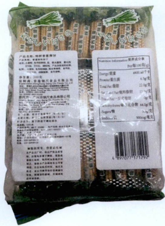
Figure 4. Unregistered Crackers in a Clear and Green Plastic Packaging (In Foreign Language)