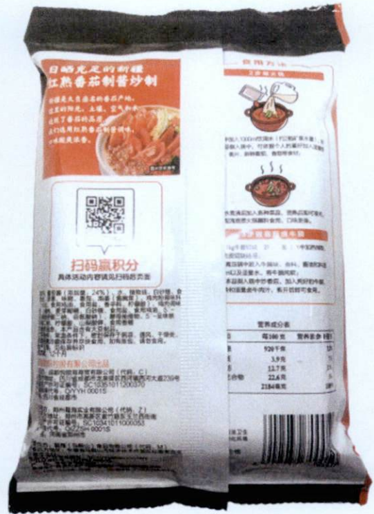
Figure 2. Unregistered HI Tomato Soup in Black and Red Plastic Pouch (In Foreign Language)