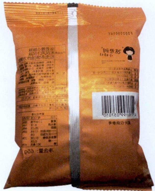
Figure 3. Unregistered WEI LIH Noodle Snack in Orange Packaging (In Foreign Language)