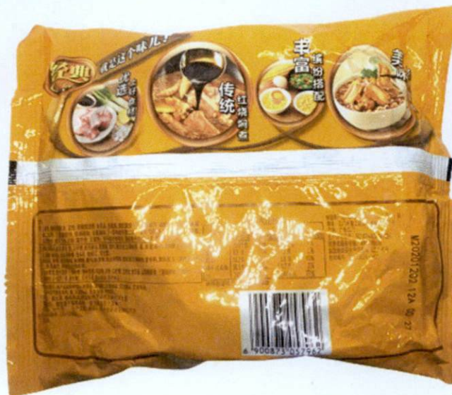
Figure 1. Unregistered Braised Pork Ribs Noodle Classic in Orange Laminated Foil Pouch (In Foreign Language)