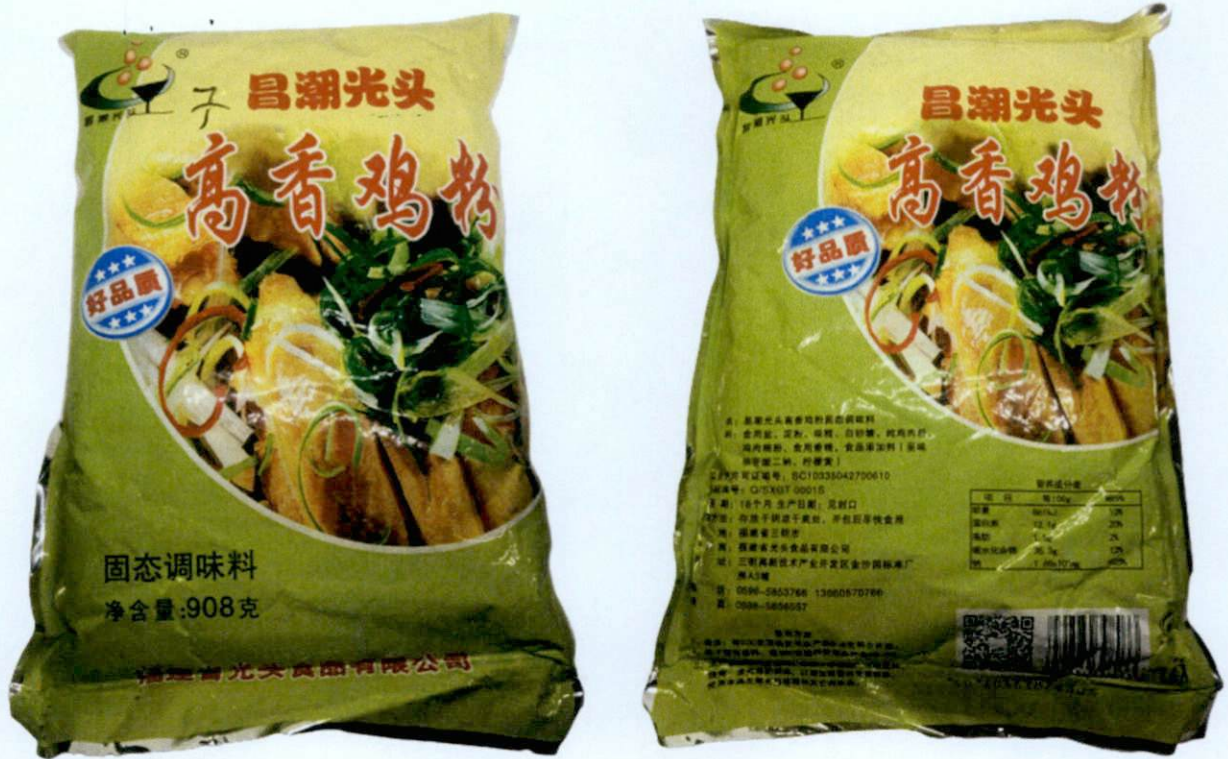
Figure 4. Unregistered Powder Form in Yellow and Light Green Plastic Pouch (In Foreign Language)