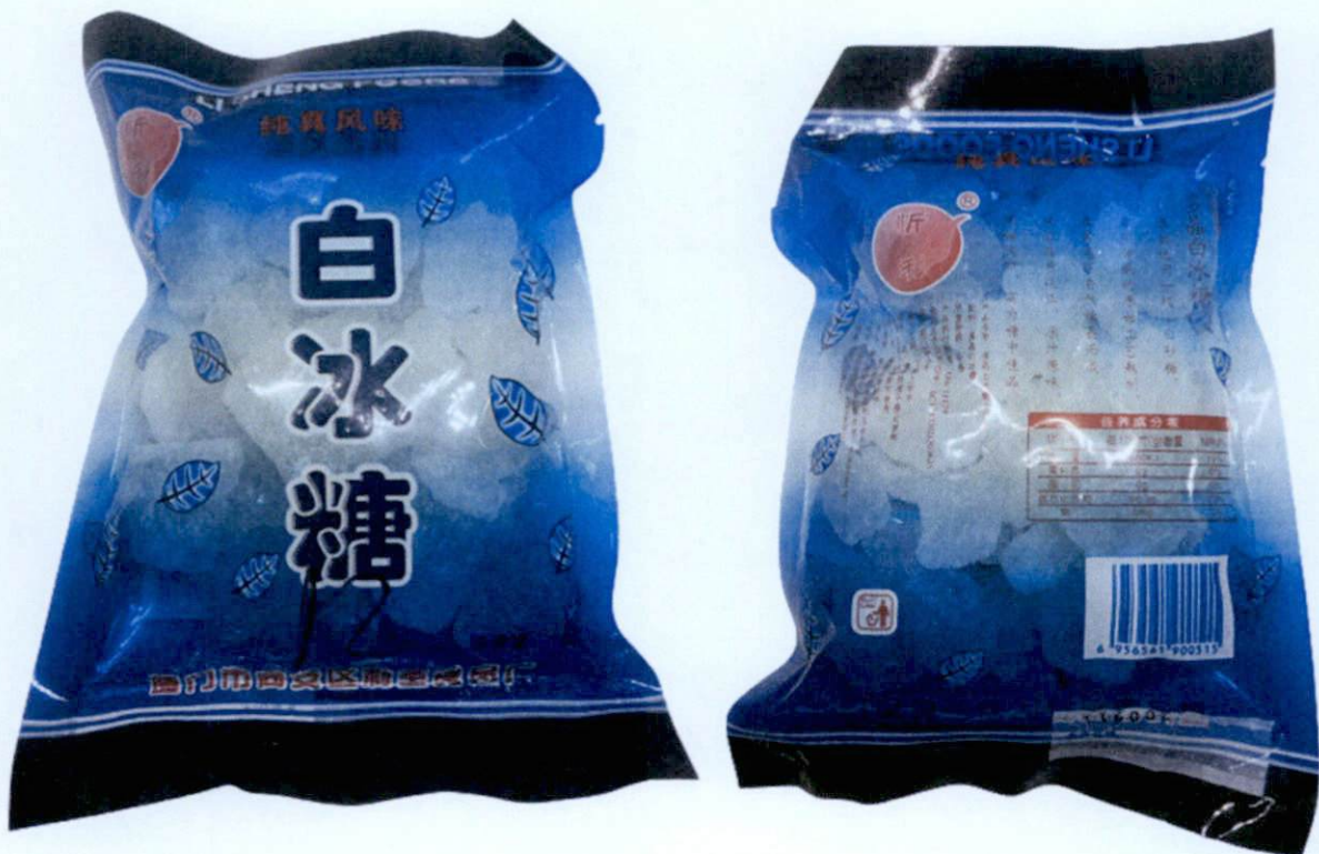
Figure 5. Unregistered LI SHENG FOODS Crystalline-like in Clear and Blue Plastic Pouch (In Foreign Language)