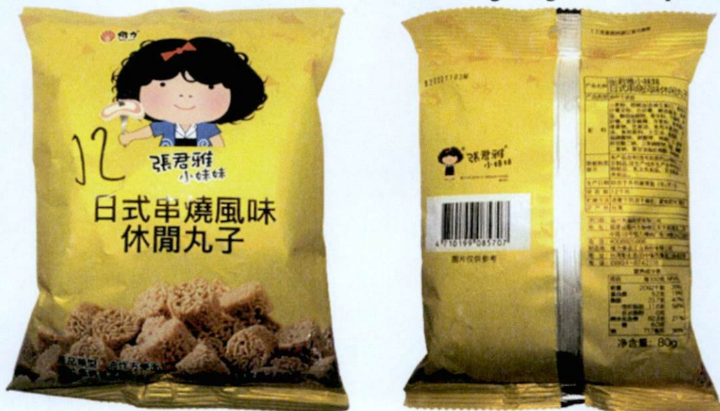
Figure 1. Unregistered WEI LIH Noodle Snack in Yellow Laminated Foil Pouch (In Foreign Language)

The Food and Drug Administration (FDA) warns all healthcare professionals and the general public NOT TO PURCHASE AND CONSUME the following unregistered food products: