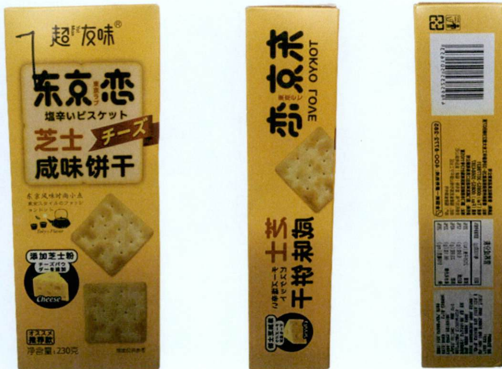
Figure 3. Unregistered YO! MAN Tokyo Flavor Tokyo Love Cheese (In Foreign Language)