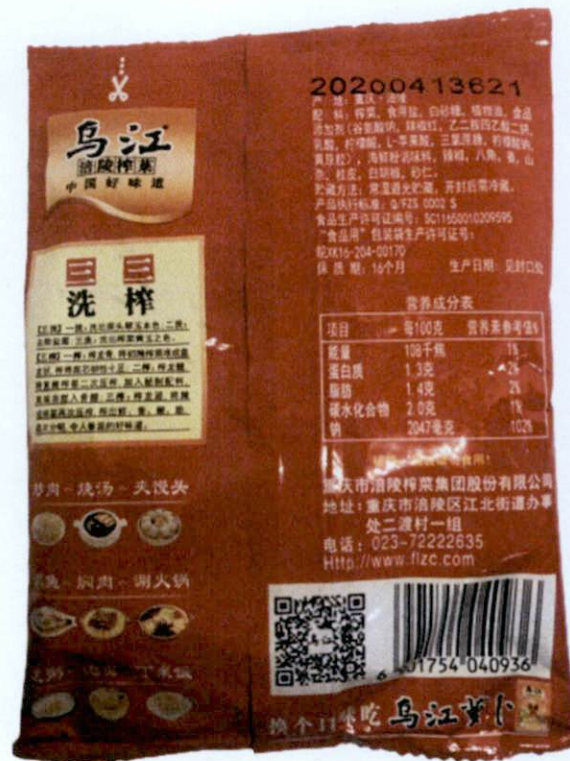
Figure 5. Unregistered Cubed Food in Red Plastic Pouch (In Foreign Language)