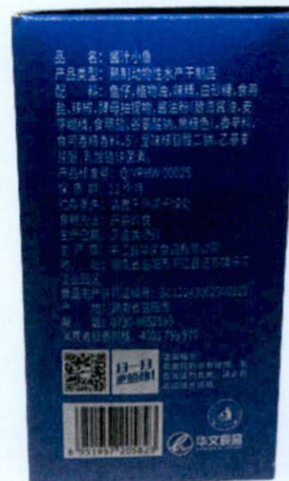
Figure 4. Unregistered JIANGZHIXIAOYU Preserved Food in White and Blue Paper Box Packaging (In Foreign Language)