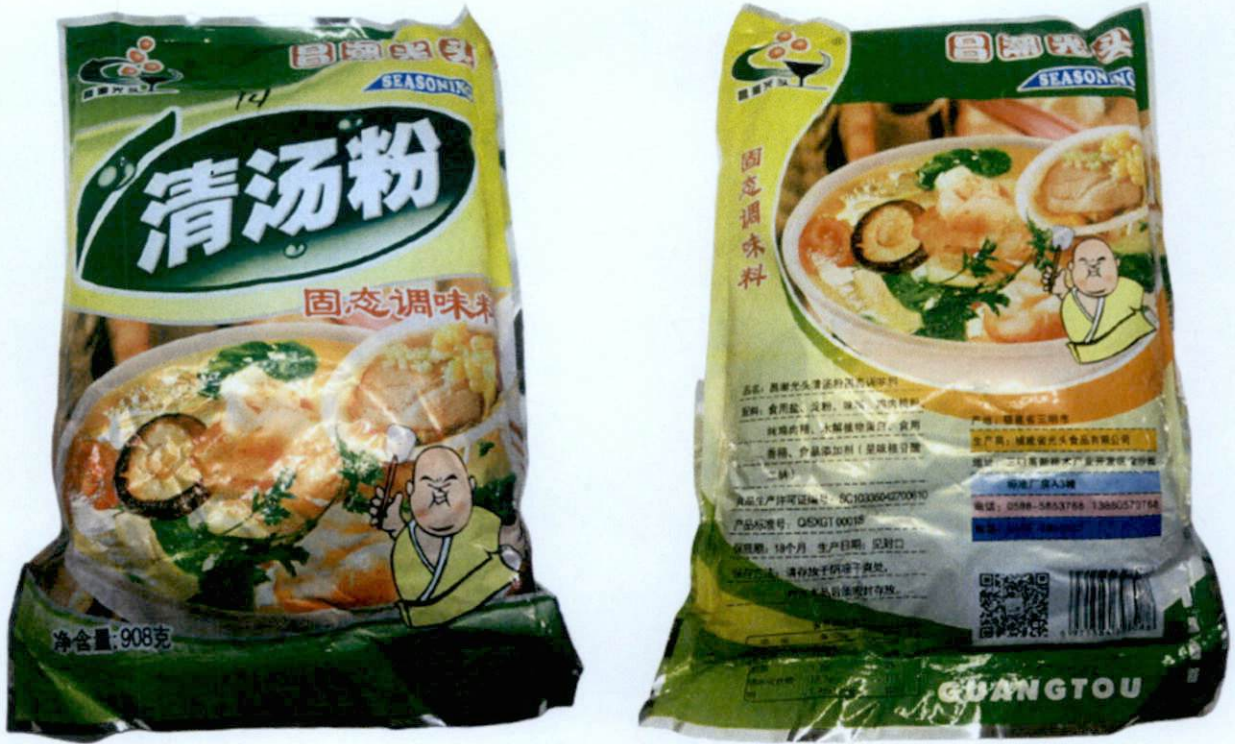
Figure 2. Unregistered GUANGTOU Seasoning (In Foreign Language)