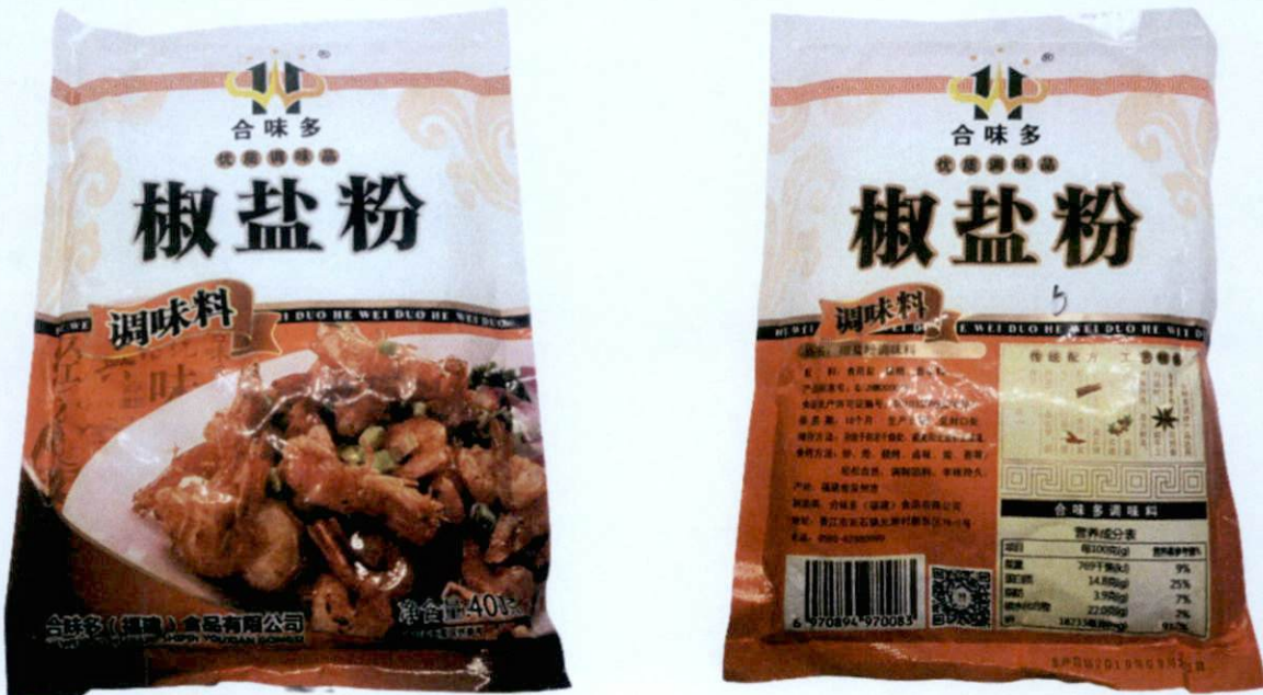
Figure 1. Unregistered HE WEI DUO (FUJIAN) Shipin Youxian Gongsi (In Foreign Language)

The Food and Drug Administration (FDA) warns all healthcare professionals and the general public NOT TO PURCHASE AND CONSUME the following unregistered food products: