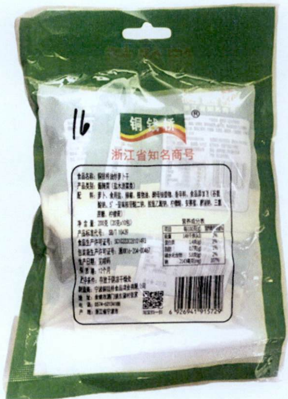
Figure 5. Unregistered TONG QIAN QIAO You Chao Luo Bo Gan Food Product in Green Packaging (In Foreign Language)