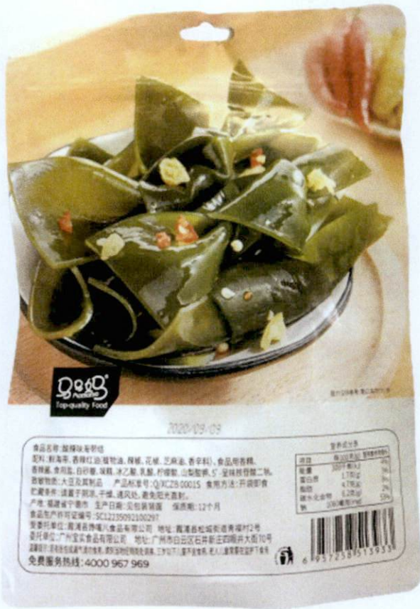
Figure 2. Unregistered MAMAMA TOP-QUALITY FOOD Seaweed-like Product (In Foreign Language)