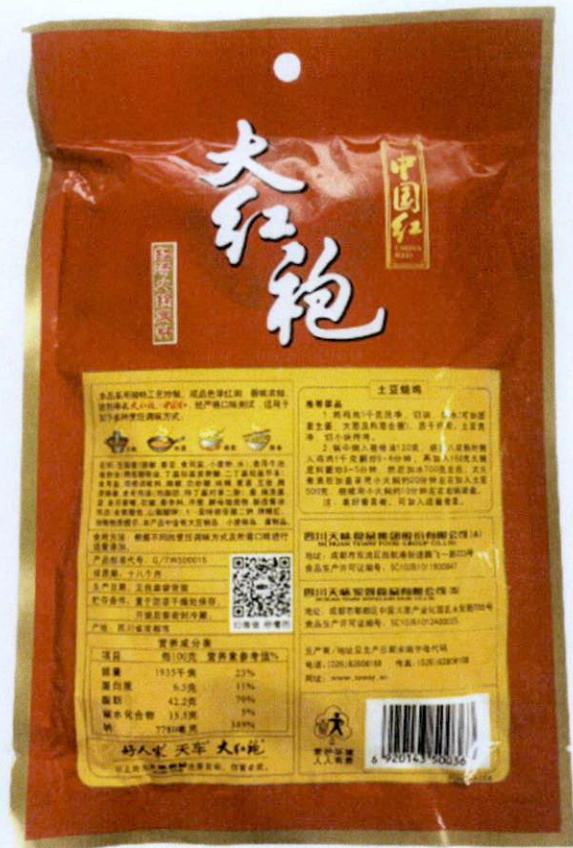
Figure 4. Unregistered CHINA RED Food Product in Red and Gold Packaging (In Foreign Language)