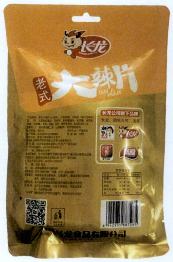
Figure 3. Unregistered CHANGLONG FOOD Dala Pian (In Foreign Language)