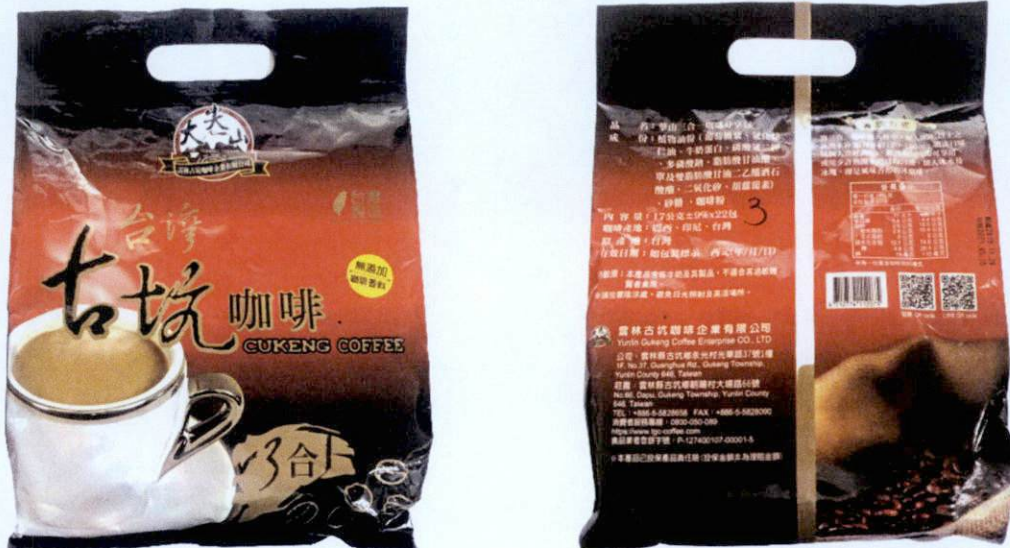
Figure 1. Unregistered TGC YUNLIN Cukeng Coffee in Red Plastic Packaging (In Foreign Language)

The Food and Drug Administration (FDA) warns all healthcare professionals and the general public NOT TO PURCHASE AND CONSUME the following unregistered food products: