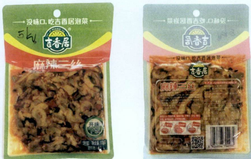
Figure 1. Unregistered JI XIANG JU Fermented Vegetables-like Product (In Foreign Language)

The Food and Drug Administration (FDA) warns all healthcare professionals and the general public NOT TO PURCHASE AND CONSUME the following unregistered food products: