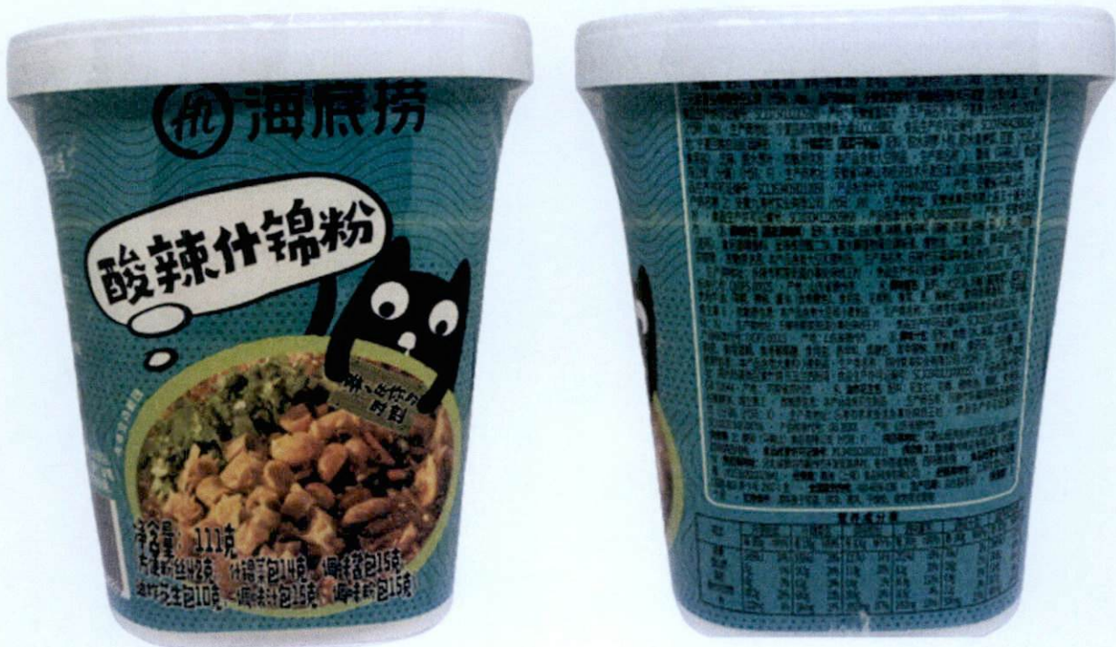
Figure 5. Unregistered HI Instant Noodle in Blue Green Plastic Cup (In Foreign Language)