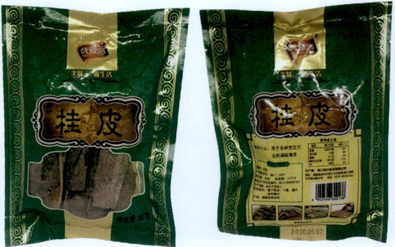
Figure 4. Unregistered YOU XIANG DAO Tree Bark-like Product (In Foreign Language)