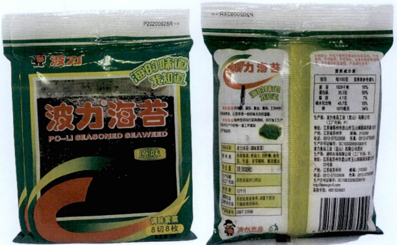
Figure 3. Unregistered Po-Li Seasoned Seaweed (In Foreign Language)