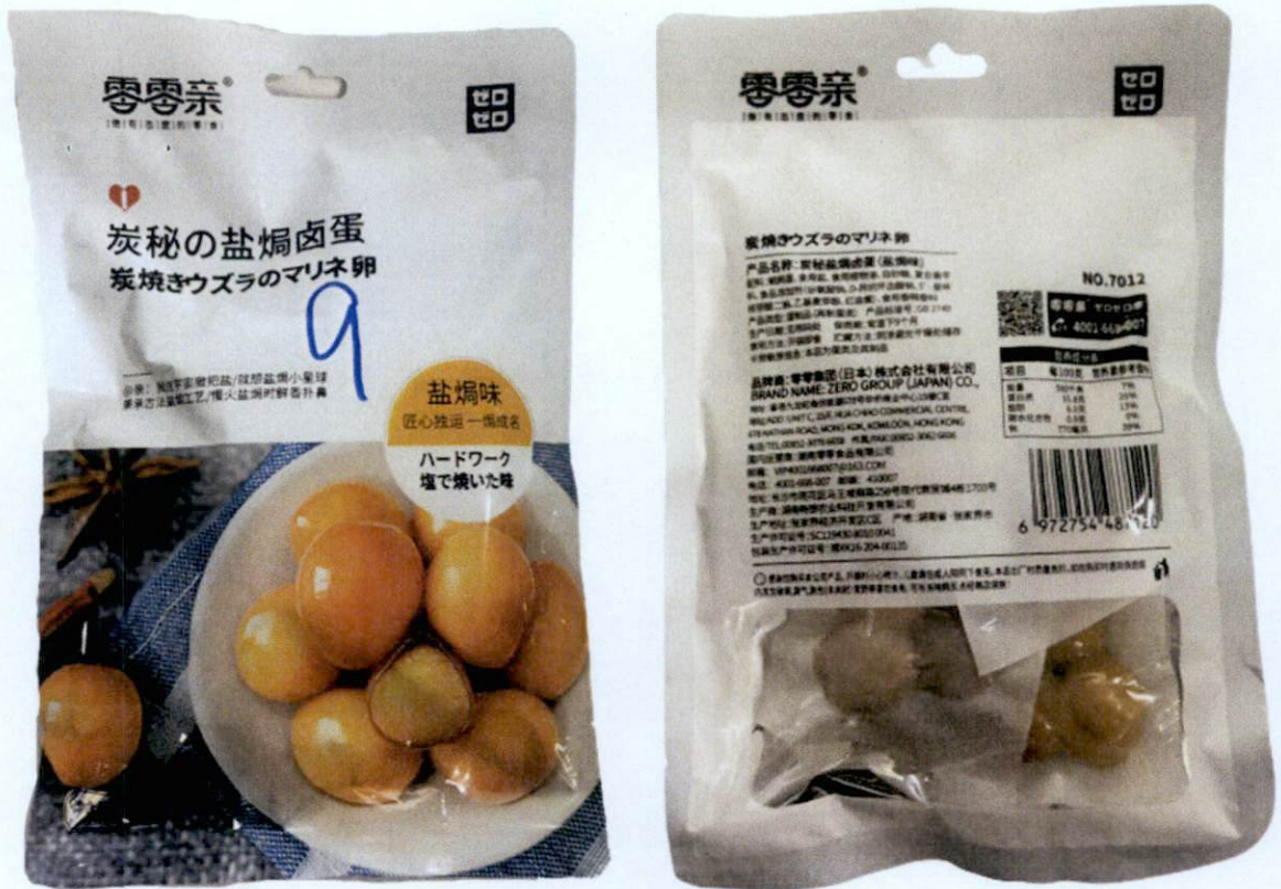
Figure 2. Unregistered ZERO GROUP (JAPAN) CO. Yolk-like Product (In Foreign Language)