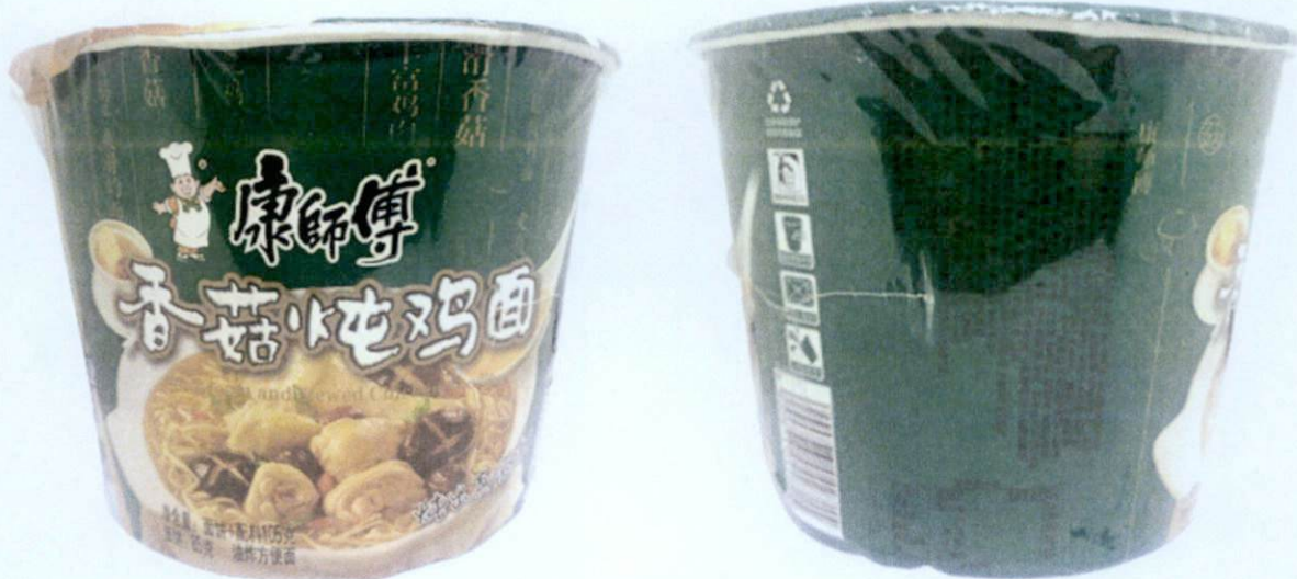
Figure 1. Unregistered Mushroom and Stewed Chicken Noodle in Green Paper Cup (In Foreign Language)

The Food and Drug Administration (FDA) warns all healthcare professionals and the general public NOT TO PURCHASE AND CONSUME the following unregistered food products: