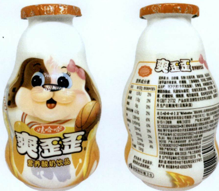
Figure 2. Unregistered Drink with Dog Image (In Foreign Language)