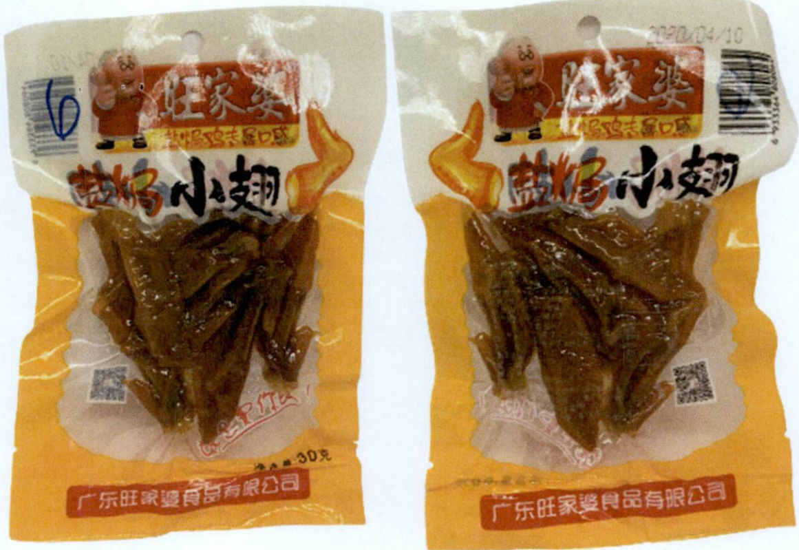
Figure 4. Unregistered Chicken Wing in Orange Vacuum Sealed Packaging (In Foreign Language)