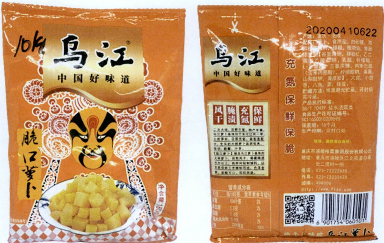
Figure 3. Unregistered Cubed Food in Orange Packaging (In Foreign Language)