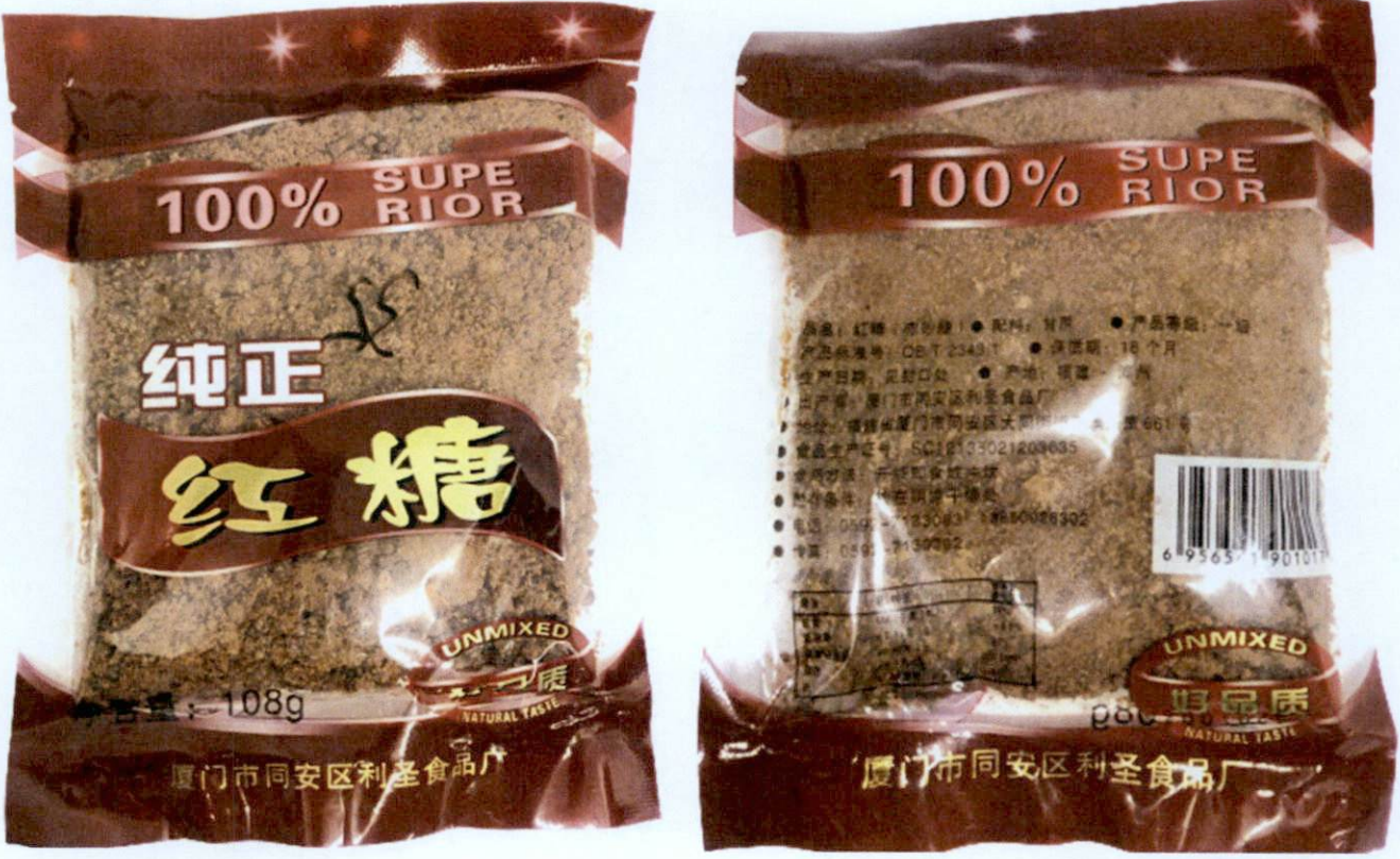
Figure 5. Unregistered 100% Superior Unmixed Natural Taste Powder (In Foreign Language)