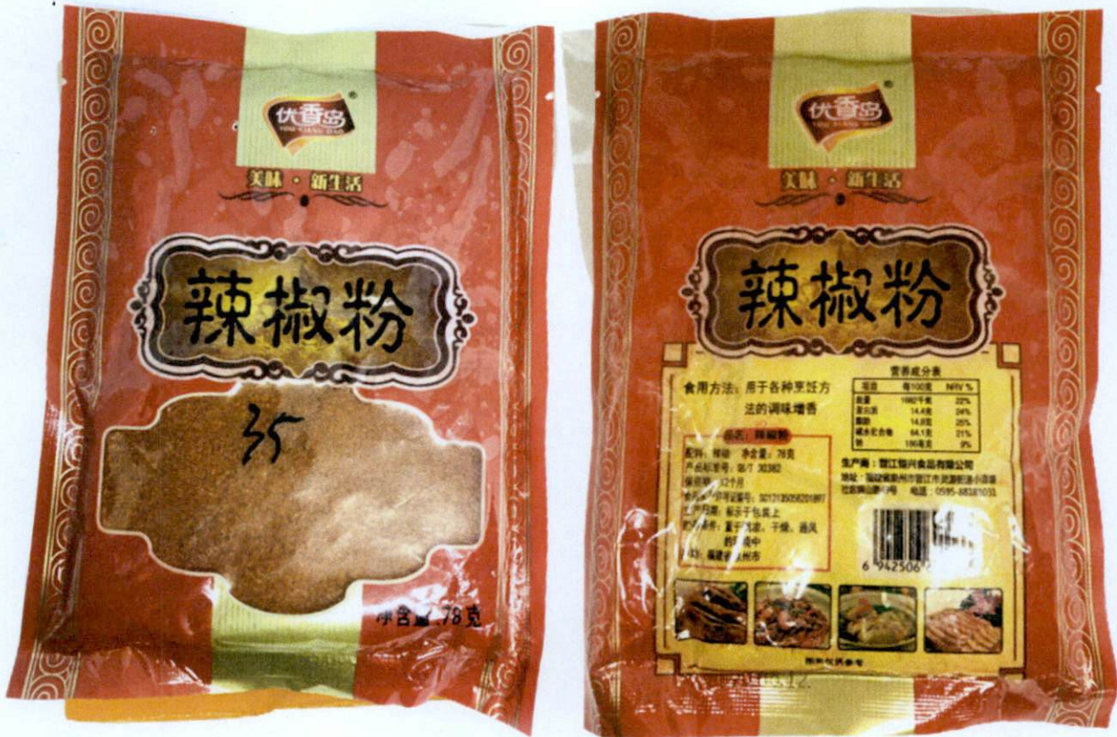
Figure 2. Unregistered YOU XIANG DAO Red Powder in Red and Clear Plastic Pouch (In Foreign Language)