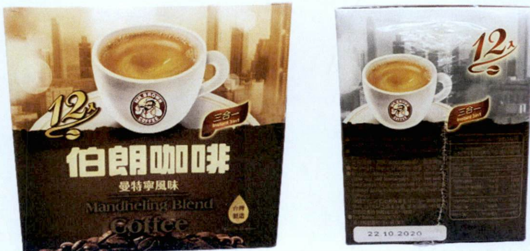
Figure 1. Unregistered MR. BROWN COFFEE Mandheling Blend Coffee Instant 3 in 1 (In Foreign Language)

The Food and Drug Administration (FDA) warns all healthcare professionals and the general public NOT TO PURCHASE AND CONSUME the following unregistered food products: