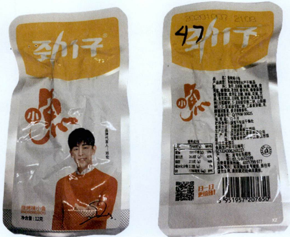
Figure 4. Unregistered SHAKAOWEIXIAOYU Food Product in White and Yellow Vacuum Sealed Plastic Packaging (In Foreign Language)