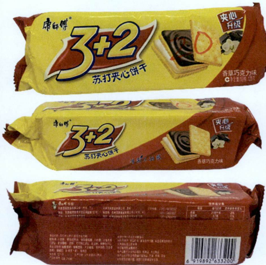
Figure 3. Unregistered 3+2 Biscuit in Yellow and Red Plastic Packaging (In Foreign Language)