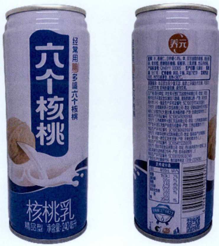
Figure 5. Unregistered Drink with Coconut Image in White and Blue Tin Can (In Foreign Language)