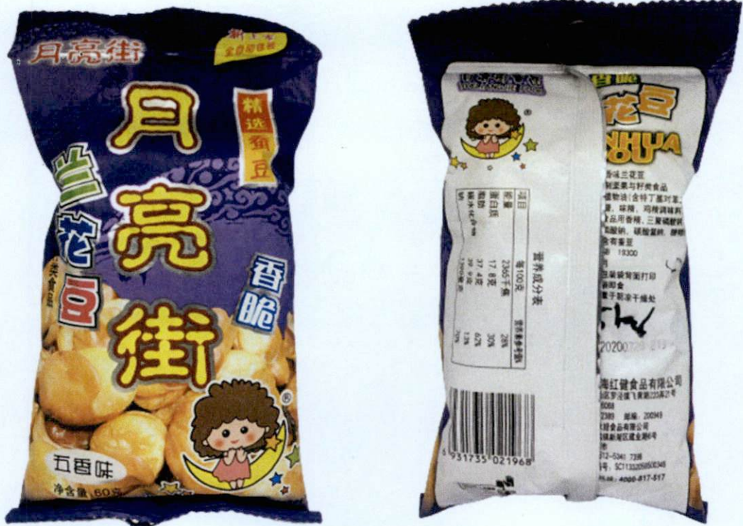
Figure 2. Unregistered YUELIANGJIE FOOD Nuts in Violet Plastic Packaging (In Foreign Language)