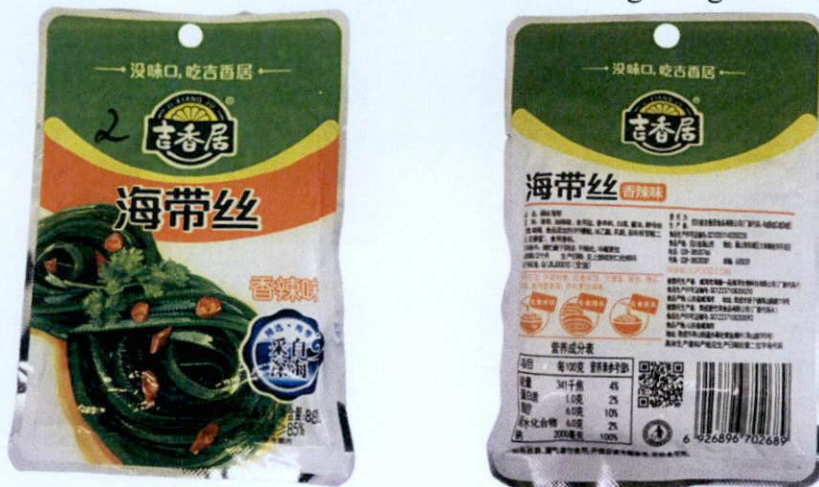
Figure 1. Unregistered JI XIANG JU String-Like Vegetable in Green and White Plastic Packaging (In Foreign Language)

The Food and Drug Administration (FDA) warns all healthcare professionals and the general public NOT TO PURCHASE AND CONSUME the following unregistered food products: