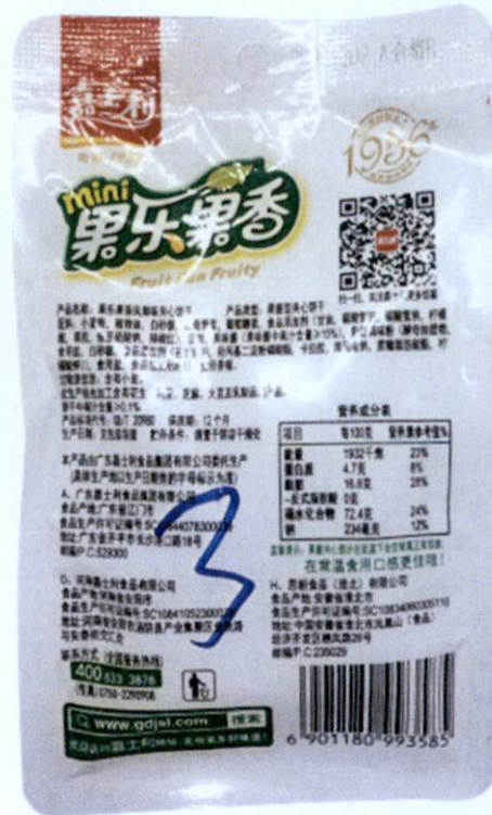
Figure 5. Unregistered Mini Fruit Fun Fruity in White and Green Plastic Packaging (In Foreign Language)