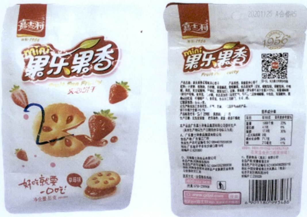
Figure 3. Unregistered MINI Fruit Fun Fruity in White and Red Plastic Packaging (In Foreign Language)