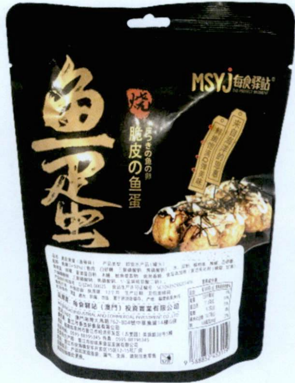
Figure 4. Unregistered MSYJ THE PERFECT MOMENT Takoyaki-like Product in Black Resealable Pouch (In Foreign Language)