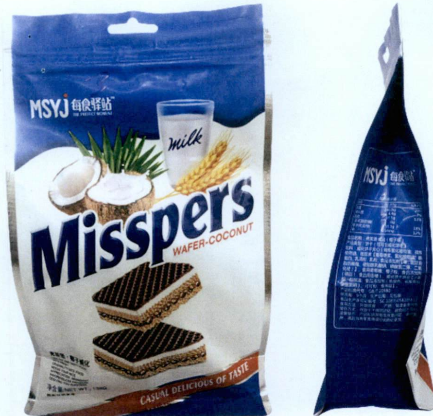
Figure 2. Unregistered MSYJ THE PERFECT MOMENT MISSPERS Wafer-Coconut (In Foreign Language)