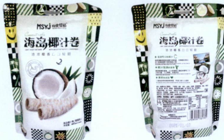
Figure 1. Unregistered MSYJ THE DELICIOUS STATION Coconut Rolls Light Crisp and Made With Delicious Natural Ingredients (In Foreign Language)

The Food and Drug Administration (FDA) warns all healthcare professionals and the general public NOT TO PURCHASE AND CONSUME the following unregistered food products: