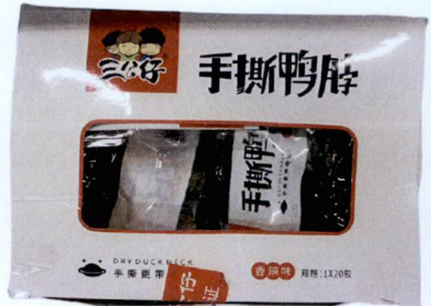
Figure 5. Unregistered Dry Duck Neck in White Box (Labels are in foreign characters)