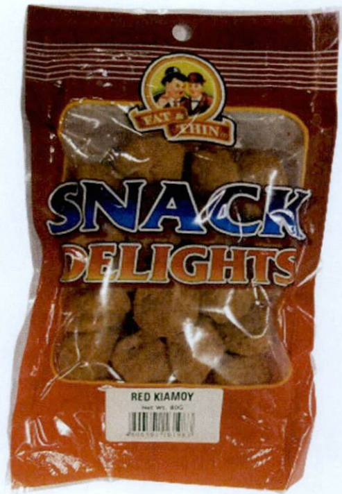
Figure 3. Unregistered FAT & THIN Snack Delights Red Kiamoy