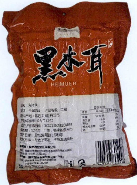
Figure 4. Unregistered HEIMUER in Red Vacuum Packaging (Labels are in foreign characters)