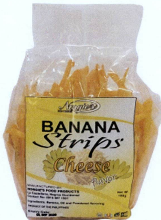
Figure 1. Unregistered NORGIE'S Banana Strips Cheese Flavor

The Food and Drug Administration (FDA) warns all healthcare professionals and the general public NOT TO PURCHASE AND CONSUME the following unregistered food products: