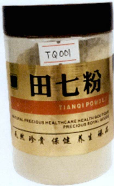
Figure 2. Unregistered TIANQI POWDER Natural Precious Healthcare Health Boutique Precious Royal Goods