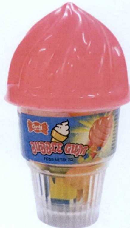
Figure 5. Unregistered CANDY STREET Bubble Gum