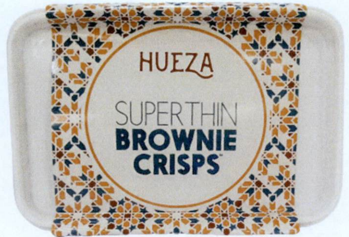
Figure 3. Unregistered HUEZA Superthin Brownie Crisps