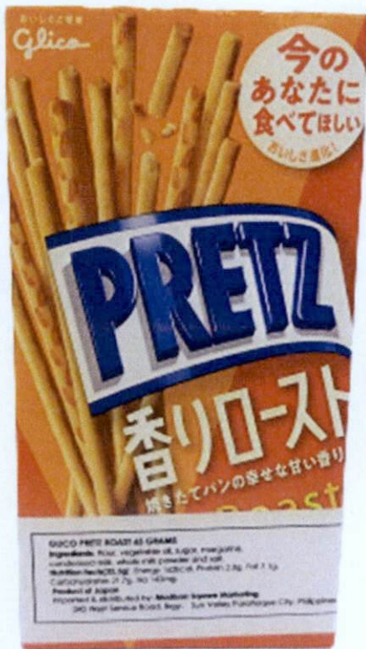
Figure 4. Unregistered GLICO Pretz Roast, 65 g