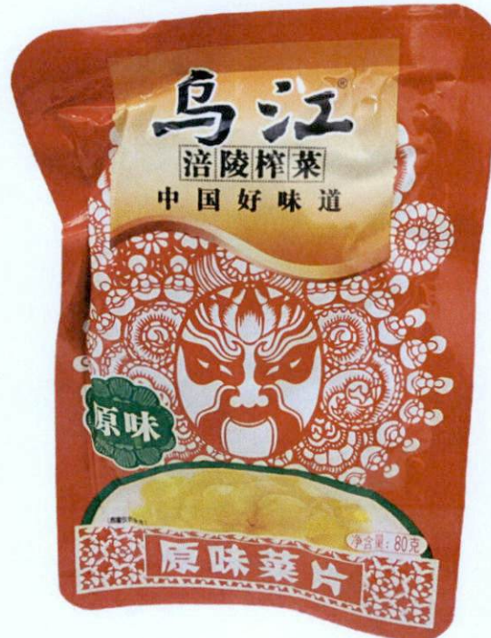
Figure 1. Unregistered Red and White Plastic Foil Pack (Labels are in foreign characters)

The Food and Drug Administration (FDA) warns all healthcare professionals and the general public NOT TO PURCHASE AND CONSUME the following unregistered food products: