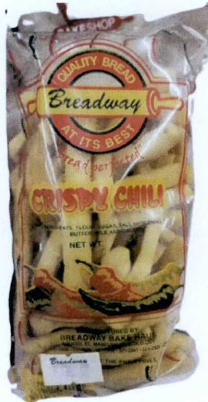
Figure 1. Unregistered BREADWAY Crispy Chili

The Food and Drug Administration (FDA) warns all healthcare professionals and the general public NOT TO PURCHASE AND CONSUME the following unregistered food products: