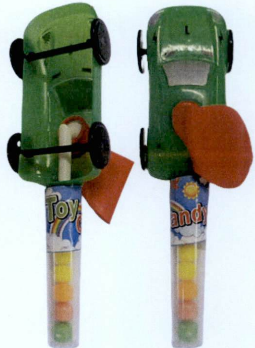
Figure 5. Unregistered (UNBRANDED) Toy Candy with Balloon and Car