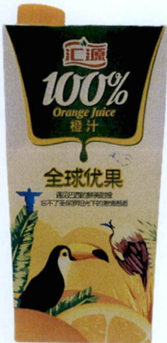
Figure 4. Unregistered HUIYAN Juice 100% Orange Juice