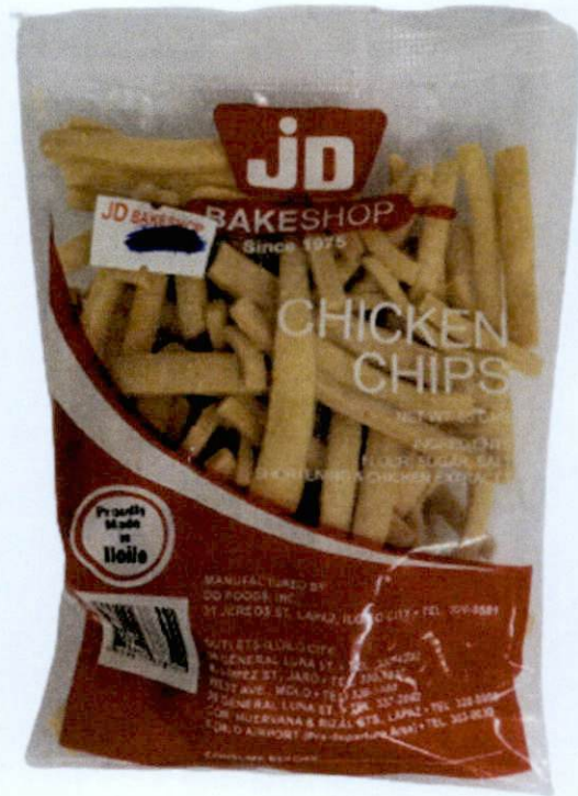
Figure 3. Unregistered JD BAKESHOP Chicken Chips