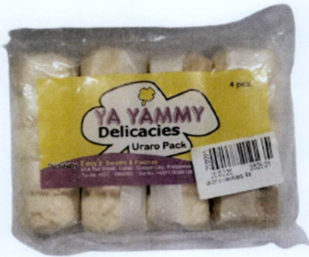
Figure 2. Unregistered YA YAMMY DELICACIES Uraro Pack