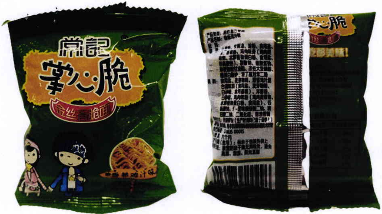
Figure 2. Unregistered Noodle Snack with Image of Boy and Girl in Green Plastic (In Foreign Language)