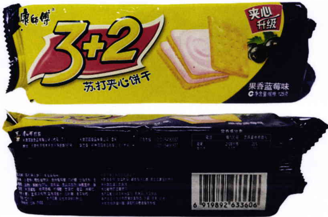
Figure 4. Unregistered 3+2 Biscuit in Yellow and Violet Packaging (In Foreign Language)