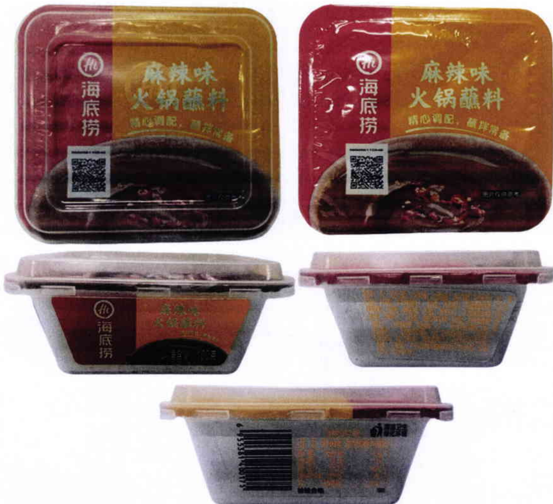
Figure 5. Unregistered HI Sauce with Red and Orange Label in White Container (In Foreign Language)