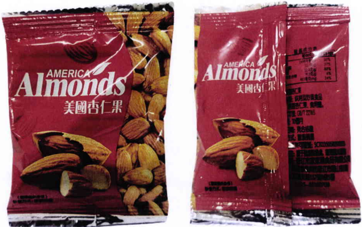
Figure 3. Unregistered AMERICA Almonds in Red Packaging (In Foreign Language)