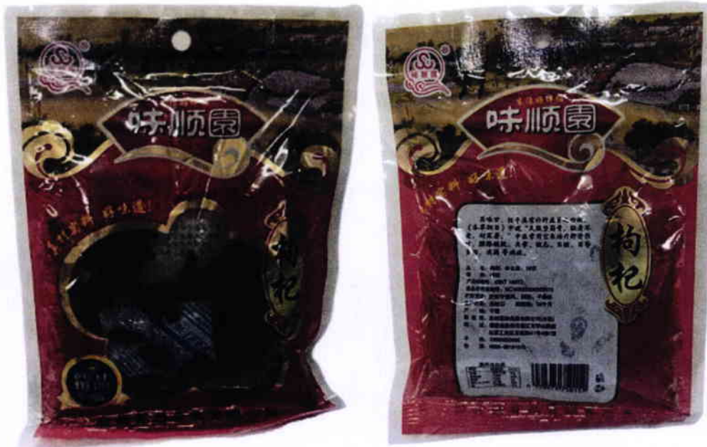
Figure 1. Unregistered Dried Seed-like Food Product with Image of Village in Red Packaging (In Foreign Language)

The Food and Drug Administration (FDA) warns all healthcare professionals and the general public NOT TO PURCHASE AND CONSUME the following unregistered food products: