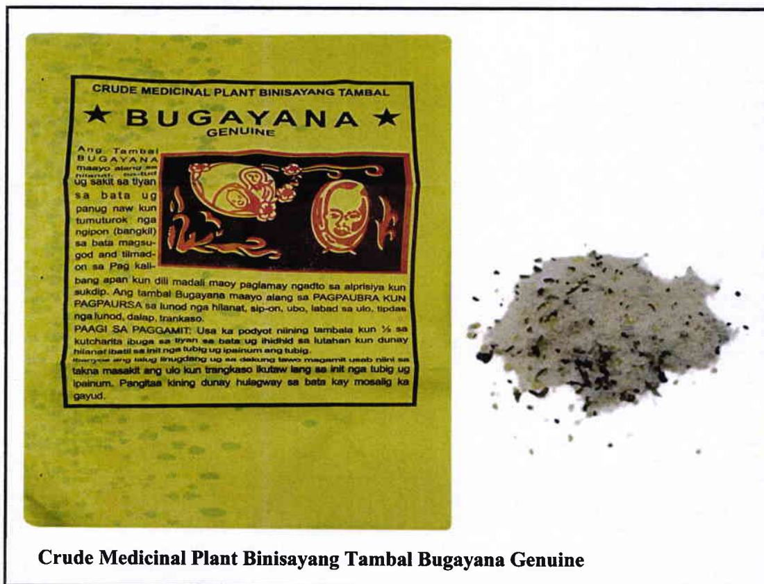
Crude Medicinal Plant Binisayang Tambal Bugayana Genuine

The Food and Drug Administration (FDA) advises the public against the purchase and use of the following unregistered drug products: