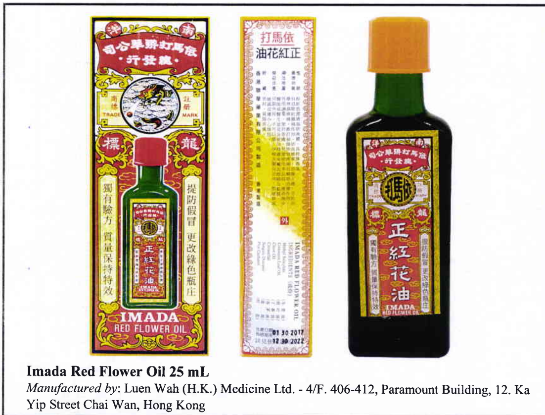
Imada Red Flower Oil 25 mL

The Food and Drug Administration (FDA) advises the public against the purchase and use of the following unregistered drug products: