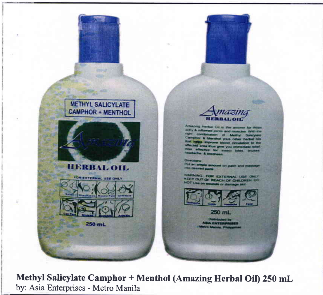
Methyl Salicylate Camphor + Menthol (Amazing Herbal Oil) 250 mL by: Asia Enterprises - Metro Manila

The Food and Drug Administration (FDA) advises the public against the purchase and use of the following unregistered drug products: