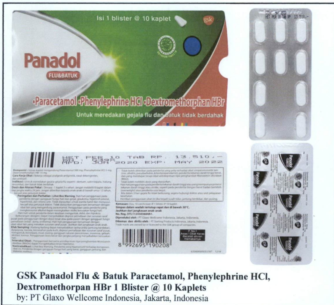
GSK Panadol Flu & Batuk Paracetamol, Phenylephrine HCl, Dextromethorpan HBr 1 Blister @ 10 Kaplets by: PT Glaxo Wellcome Indonesia, Jakarta, Indonesia

The Food and Drug Administration (FDA) advises the public against the purchase and use of the following unregistered drug products: