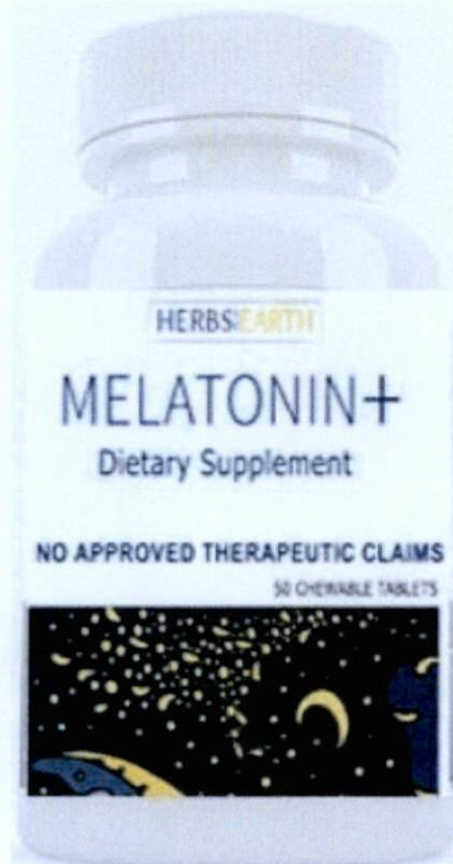
Figure 3. The Approved label of HERBS OF THE EARTH MELATONIN + Dietary Supplement with registration number FR-400006840125 valid until 21 September 2022 .

The Food and Drug Administration (FDA) informs the public that the following food supplements are now registered by the Market Authorization Holder, ECO ELEMENTS INC. in accordance to existing FDA rules and regulations.