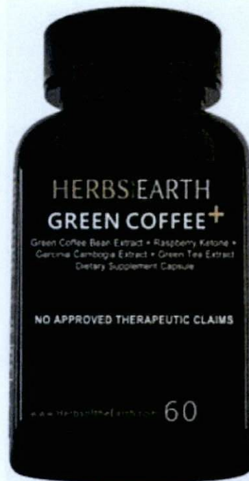
Figure 1. The Approved label of HERBS OF THE EARTH Green Coffee + Green Coffee Bean Extract + Raspberry Ketone + Garcinia Cambogia Extract + Green Tea Extract Dietary Supplement, 60 Capsules with registration number FR-4000005553590 valid until 30 June 2022 .

The Food and Drug Administration (FDA) informs the public that the food supplement HERBS OF THE EARTH Green Coffee + Bean and Ketones with Garcinia, Raspberry, Ketones & Green Tea Dietary Supplement, 60 Capsules is now registered by the Market Authorization Holder, ECO ELEMENTS INC. in accordance to existing FDA rules and regulations.