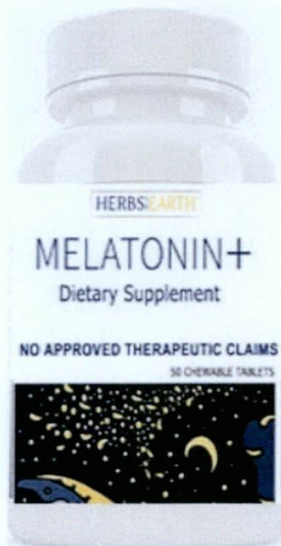
Figure 1. The Approved label of HERBS OF THE EARTH MELATONIN + Dietary Supplement with registration number FR-400006840125 valid until 21 September 2022 .

The Food and Drug Administration (FDA) informs the public that the following food supplements are now registered by the Market Authorization Holder, ECO ELEMENTS INC. in accordance to existing FDA rules and regulations.