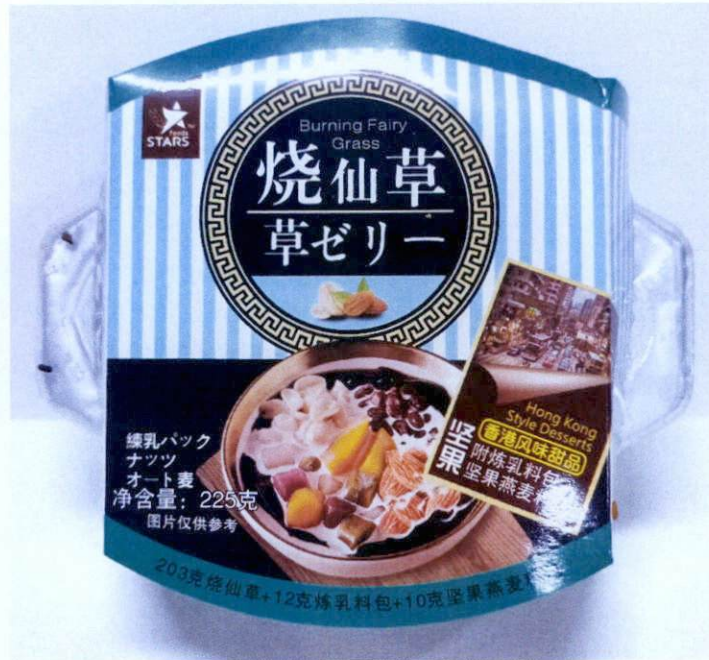
Figure 4. Unregistered BURNING FAIRY GRASS Hongkong Style Desserts in Plastic Jar with Light Green and Black Label (In Foreign Language)