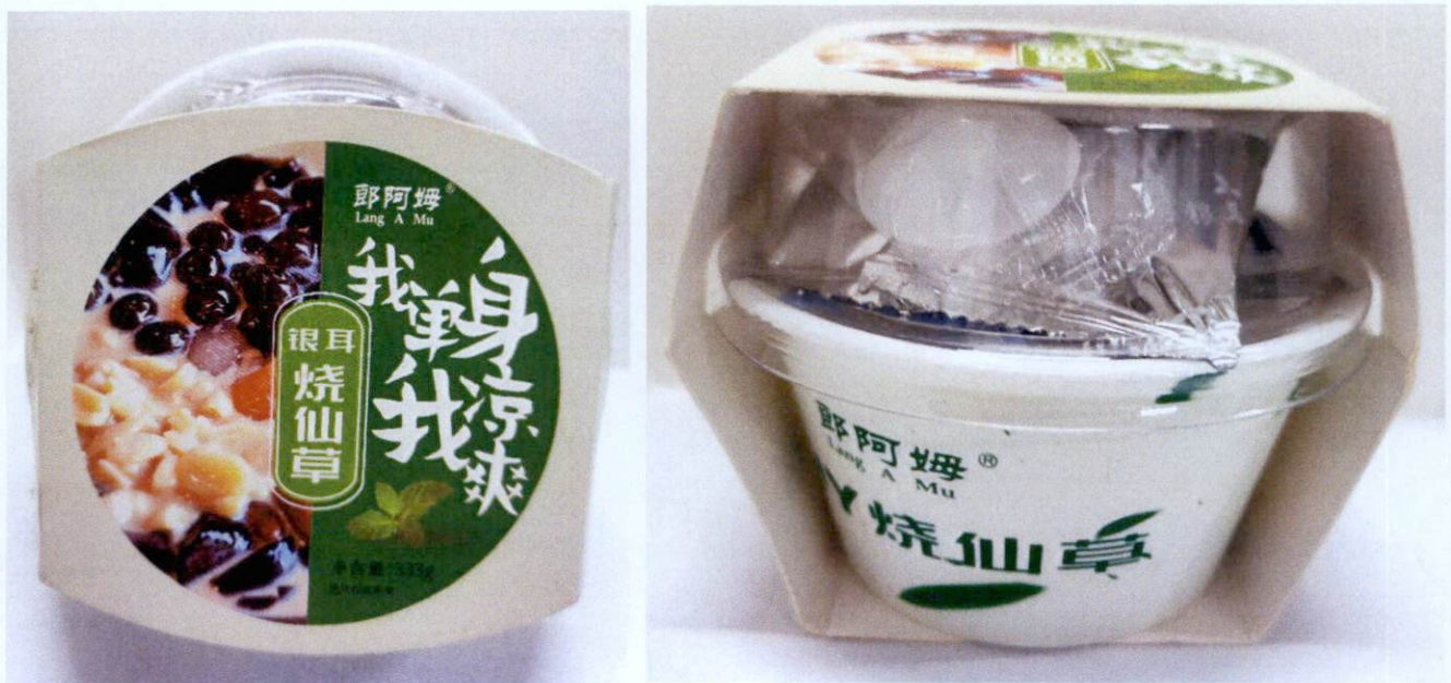
Figure 5. Unregistered LANG A MU Dessert in Plastic Jar (In Foreign Language)

The FDA verified through post-marketing surveillance that the abovementioned food products are not registered and no corresponding Certificates of Product Registration (CPR) have been issued. Pursuant to the Republic Act No. 9711, otherwise known as the “Food and Drug