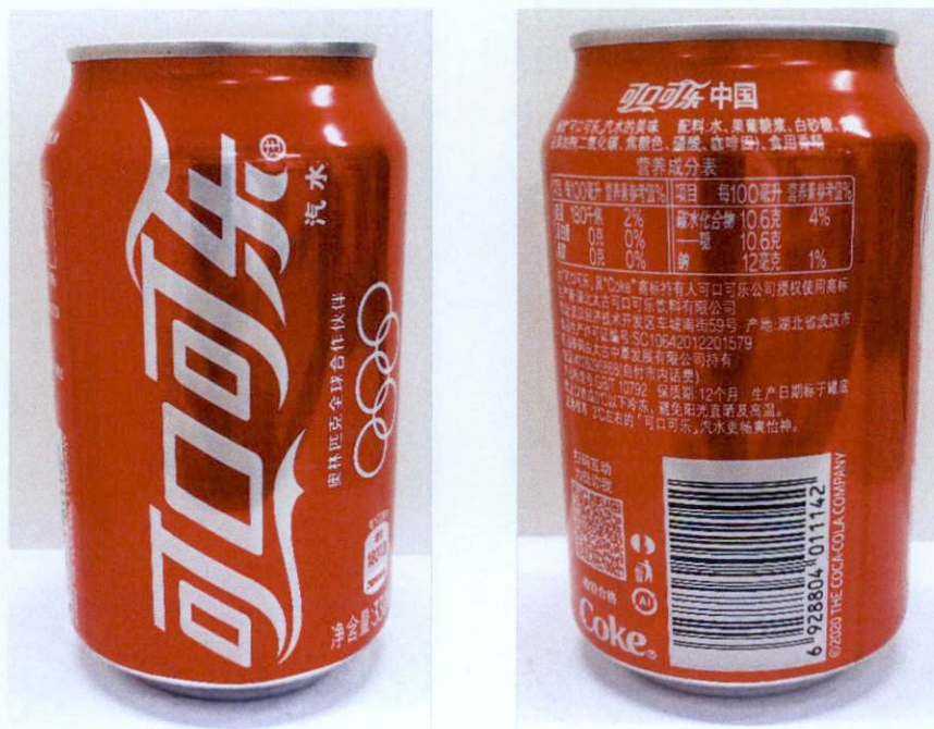
Figure 1. Unregistered Coke Drink in Red Easy Open Can (In Foreign Language)

The Food and Drug Administration (FDA) warns all healthcare professionals and the general public NOT TO PURCHASE AND CONSUME the following unregistered food products: