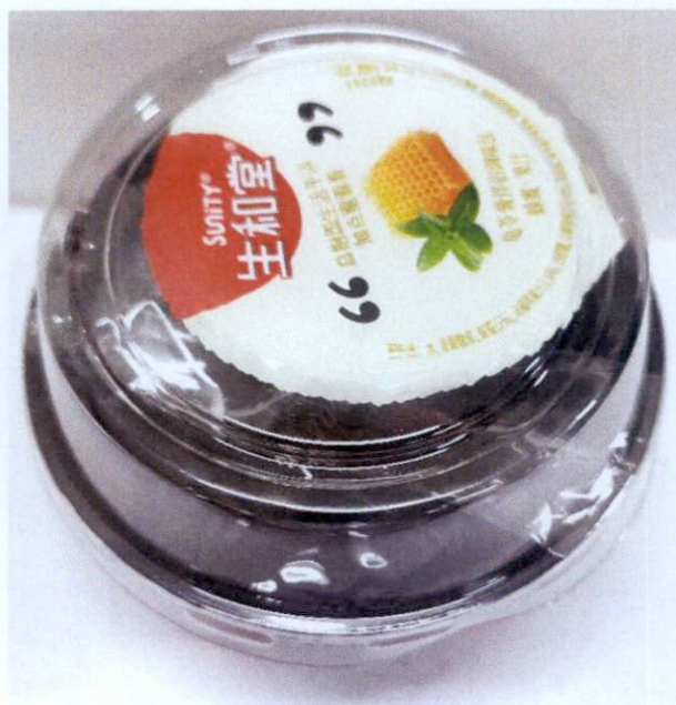
Figure 3. Unregistered SUNITY Jelly in Plastic Jar with Red Label (In Foreign Language)