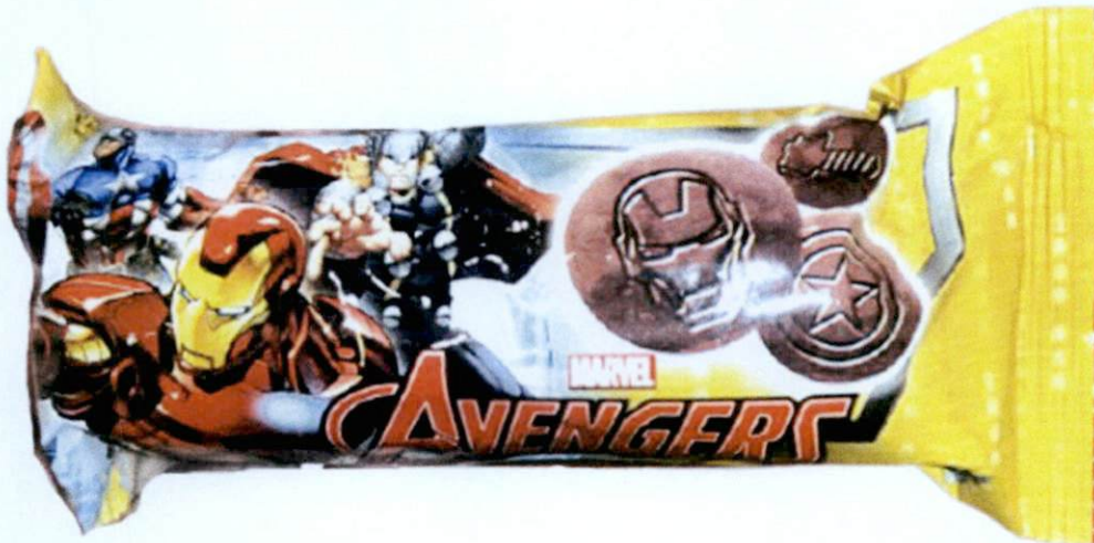
Figure 1. Unregistered JUJU MARVEL AVENGERS Chocolate Biscuits

The Food and Drug Administration (FDA) warns all healthcare professionals and the general public NOT TO PURCHASE AND CONSUME the following unregistered food products and food supplement: