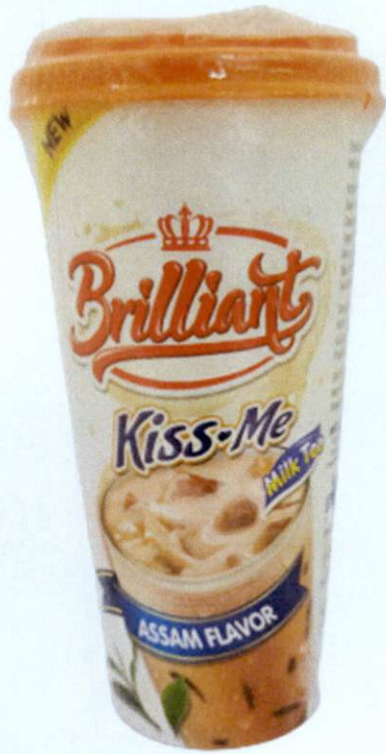
Figure 2. Unregistered BRILLIANT KISS ME Milk Tea Assam Flavor