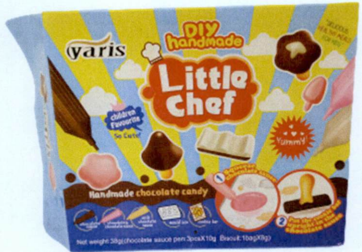
Figure 3. Unregistered YARIS LITTLE CHEF Handmade Chocolate Candy