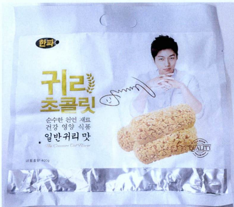
Figure 4. Unregistered The Common Oat Flavor in Plastic with White Label (In Foreign Language)