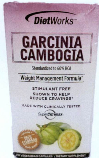
Figure 5. Unregistered DIETWORKS Garcinia Cambogia Dietary Supplement