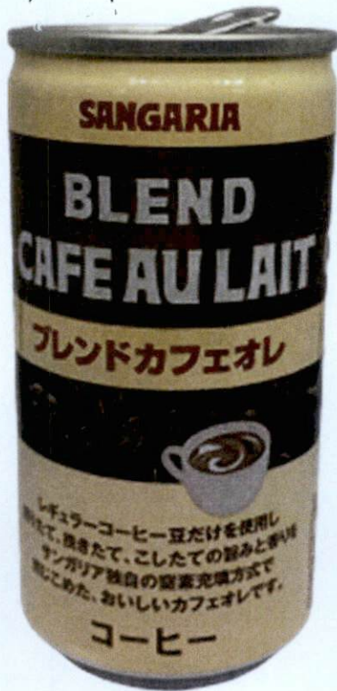
Figure 2. Unregistered SANGARIA Blend Café Au Lait