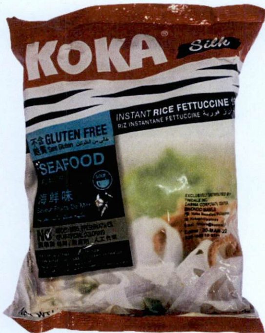
Figure 4. Unregistered KOKA Silk Instant Rice Fettuccine Seafood Flavor