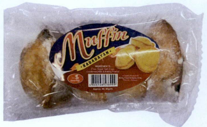
Figure 5. Unregistered MARBY Muffin Kababayan