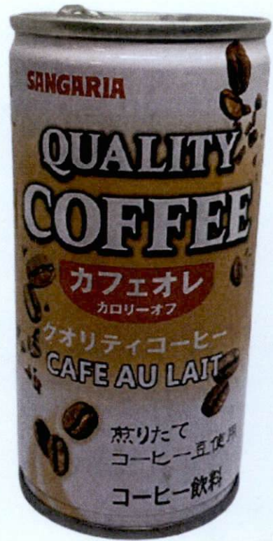
Figure 3. Unregistered SANGARIA Quality Coffee Café Au Lait