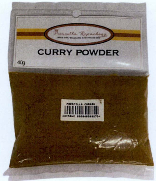
Figure 3. Unregistered PRESCILLA REPACKING Curry Powder, 40 g