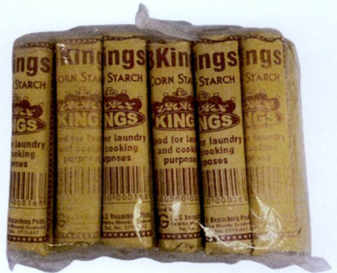
Figure 5. Unregistered 3 KINGS Corn Starch