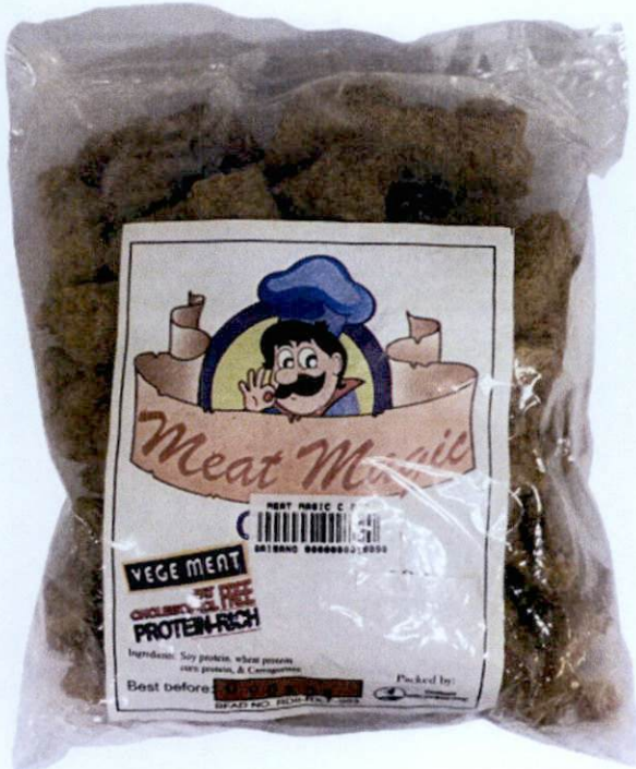
Figure 4. Unregistered MEAT MAGIC Veggie Meat