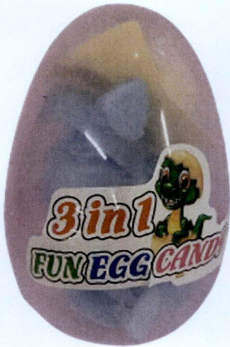
Figure 2. Unregistered (UNBRANDED) 3 IN 1 Fun Egg Candy