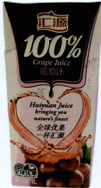
Figure 3. Unregistered HUIYUAN Juice 100% Grape Juice