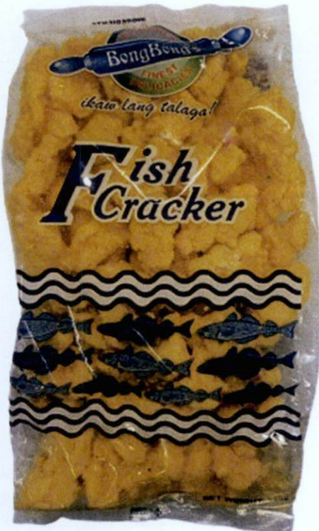
Figure 4. Unregistered BONGBONG'S Fish Cracker