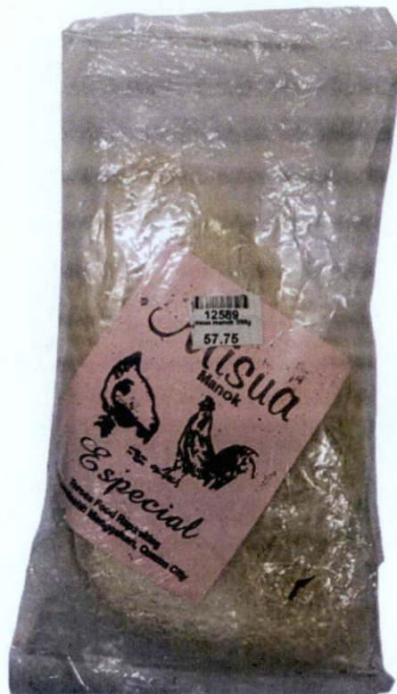
Figure 1. Unregistered MISUA Manok Especial

The Food and Drug Administration (FDA) warns all healthcare professionals and the general public NOT TO PURCHASE AND CONSUME the following unregistered food products: