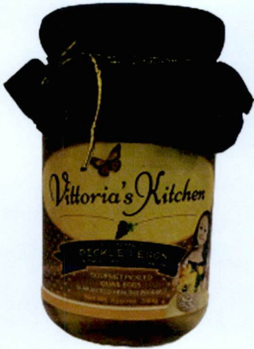
Figure 2. Unregistered VITTORIA'S KITCHEN Gourmet Pickled Eggs in Sweet and Spicy Brine, Gourmet Pickled Quail Eggs, 240g