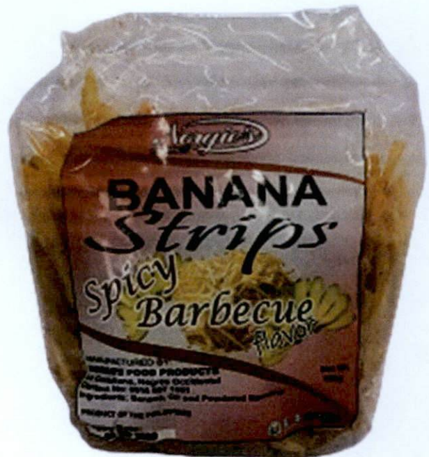
Figure 5. Unregistered NORGIE'S Banana Strips Spicy Barbecue Flavor