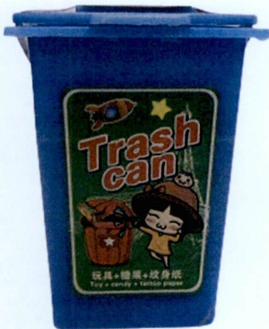
Figure 4. Unregistered TRASH CAN Candy