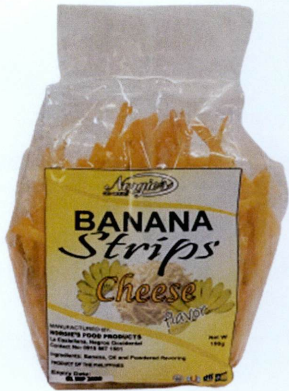
Figure 3. Unregistered NORGIE'S Banana Strips Cheese Flavor