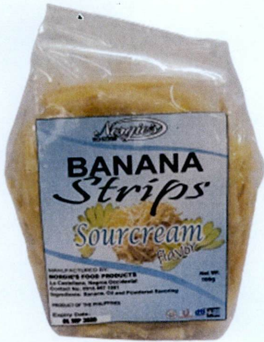
Figure 2. Unregistered NORGIE'S Banana Strops Sourcream Flavor