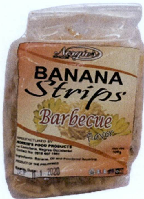
Figure 1. Unregistered NORGIE'S Banana Strips Barbecue Flavor

The Food and Drug Administration (FDA) warns all healthcare professionals and the general public NOT TO PURCHASE AND CONSUME the following unregistered food products: