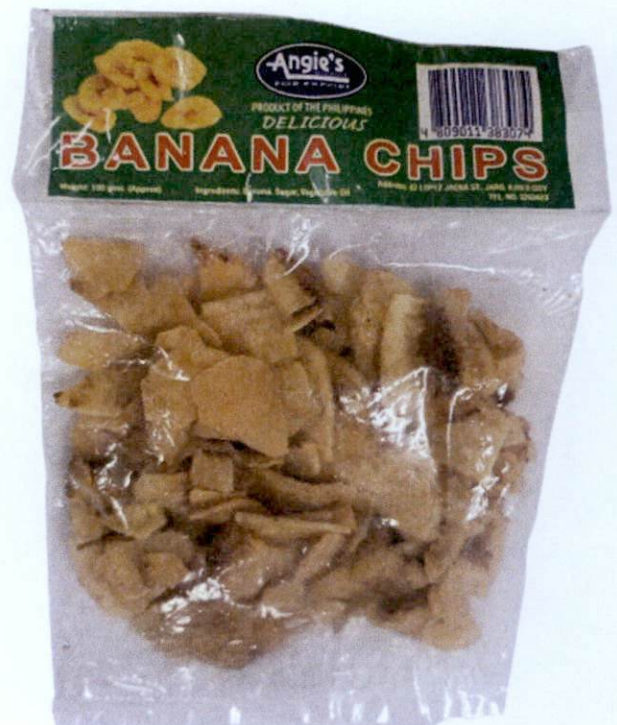
Figure 5. Unregistered ANGIE'S Banana Chips