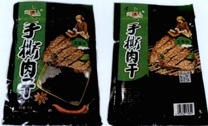
Figure 1. Unregistered MIN ZHI WEI Dried Food Product with Meat and Chili Image in Green and Black Packaging (In Foreign Language)

The Food and Drug Administration (FDA) warns all healthcare professionals and the general public NOT TO PURCHASE AND CONSUME the following unregistered food products: