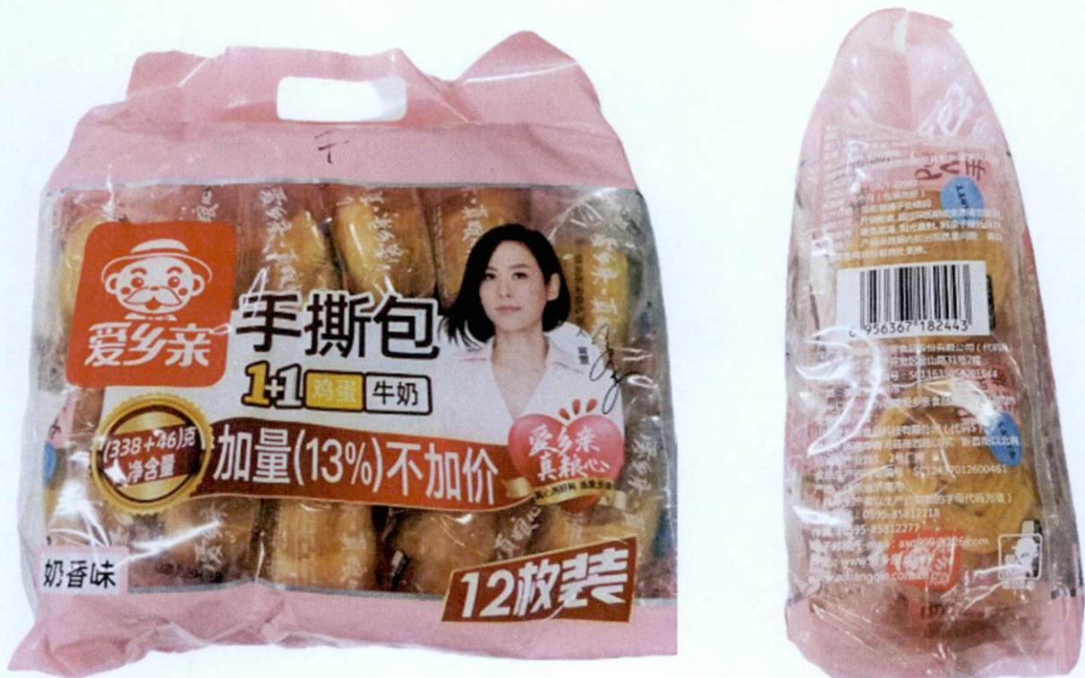
Figure 3. Unregistered Bread-like Food Product with Image of Woman in Pink and Transparent Packaging (In Foreign Language)