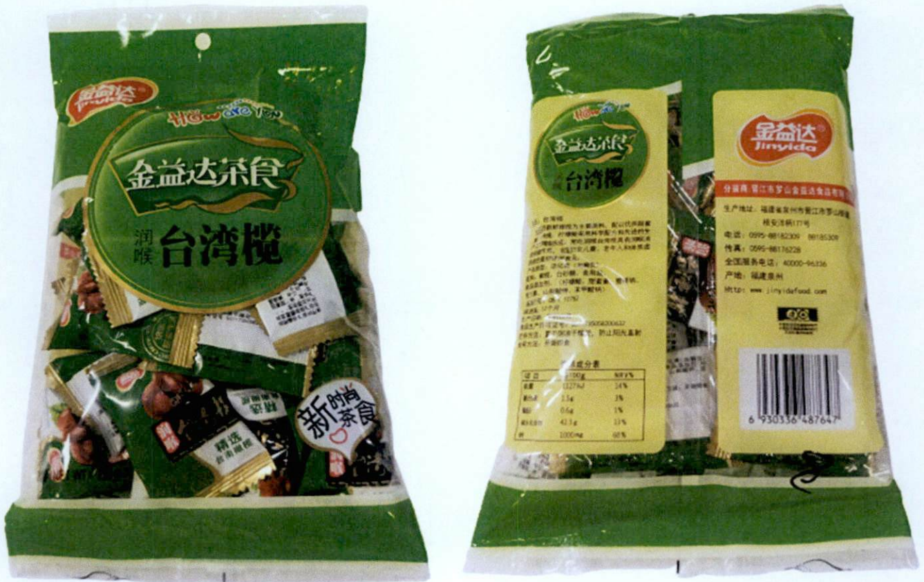
Figure 5. Unregistered JINYIDA How Are You Candy in Green Plastic Pouch (In Foreign Language)