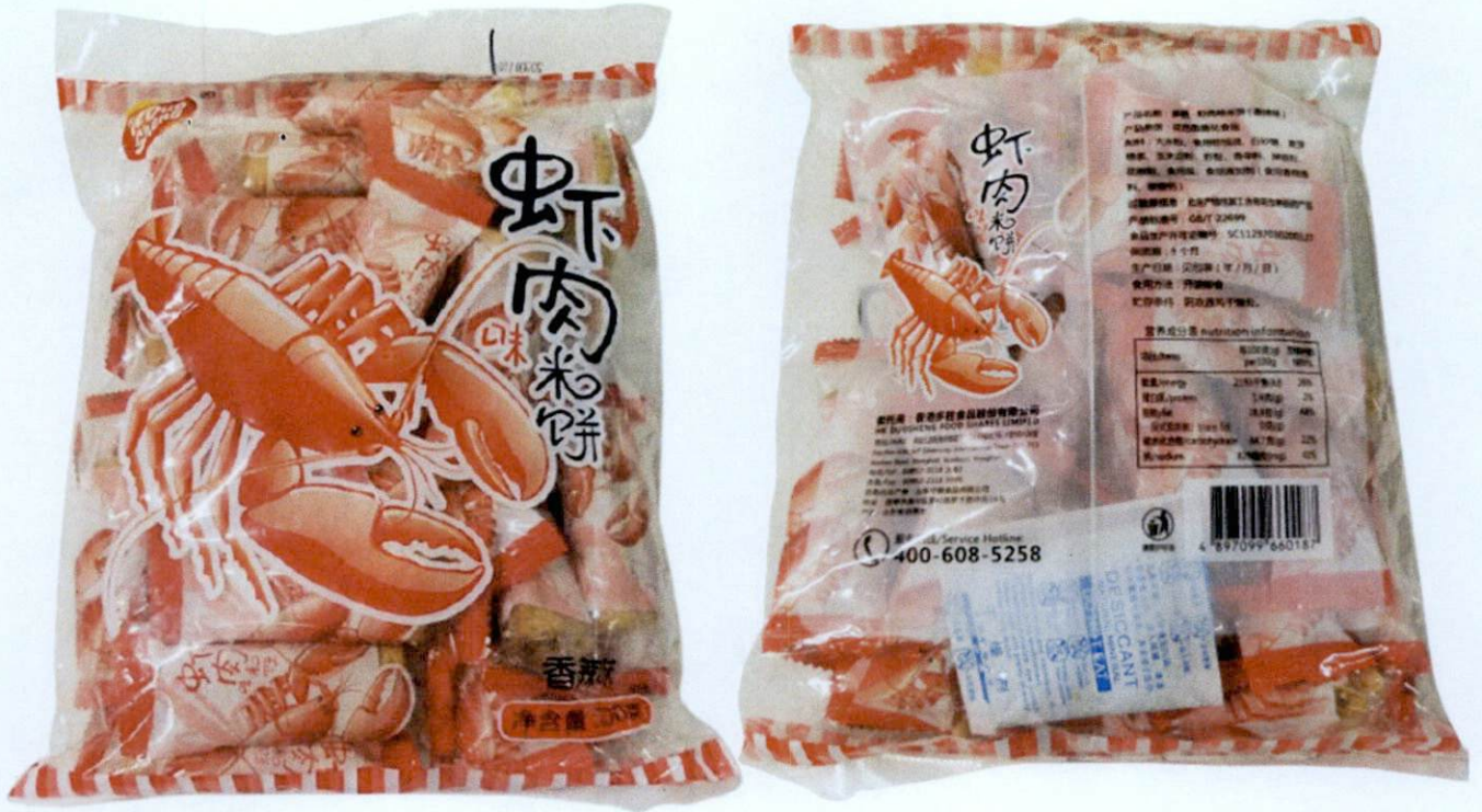
Figure 4. Unregistered DUO SHENG Food Product with Lobster Image in Red and White Transparent Packaging (In Foreign Language)