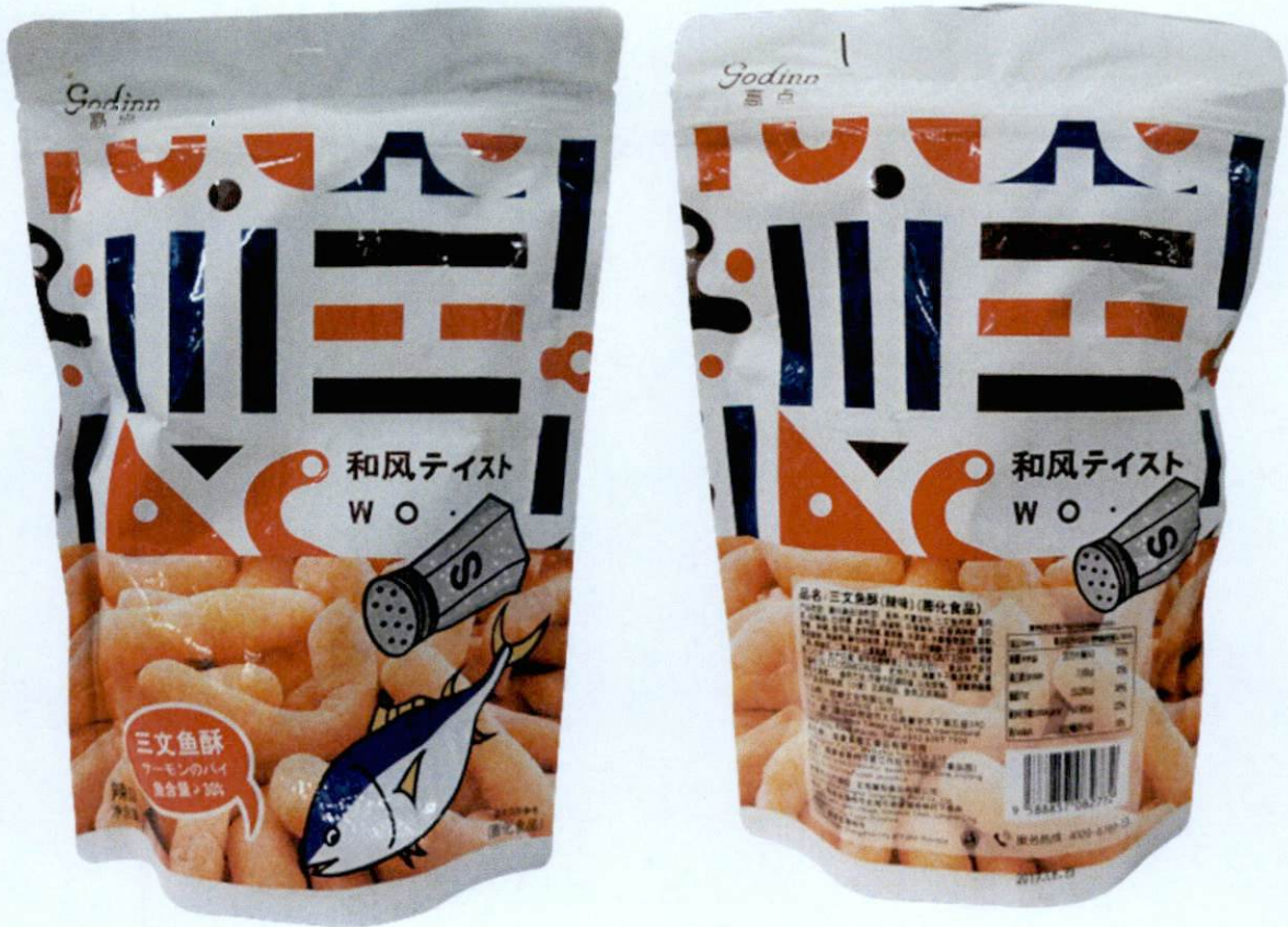
Figure 2. Unregistered GODINN Food Product with Fish and Salt Image in White Plastic Pouch (In Foreign Language)