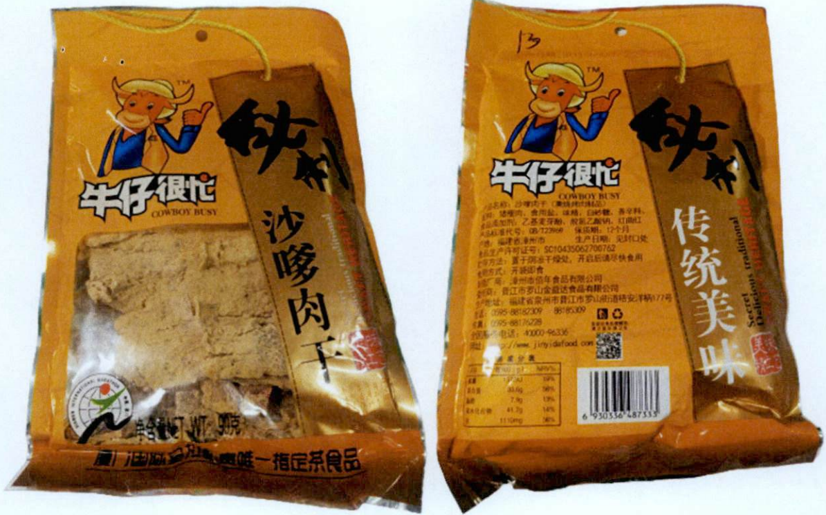
Figure 4. Unregistered COWBOY BUSY SECRET DELICIOUS TRADITIONAL CRAFT HERITAGE Food Product in Orange and Gold Plastic Packaging (In Foreign Language)