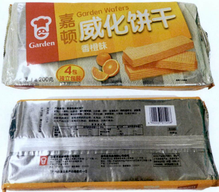
Figure 3. Unregistered GARDEN Garden Wafers in Orange Packaging (In Foreign Language)