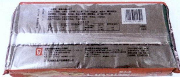
Figure 1. Unregistered GARDEN Garden Wafers in Red Packaging (In Foreign Language)