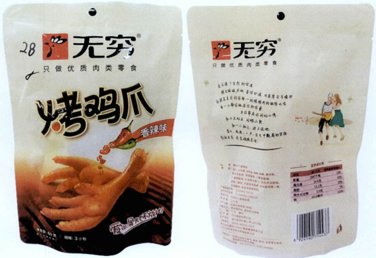
Figure 5. Unregistered Preserved Chicken Feet with Chili Image in Peach Stand-up Pouch (In Foreign Language)