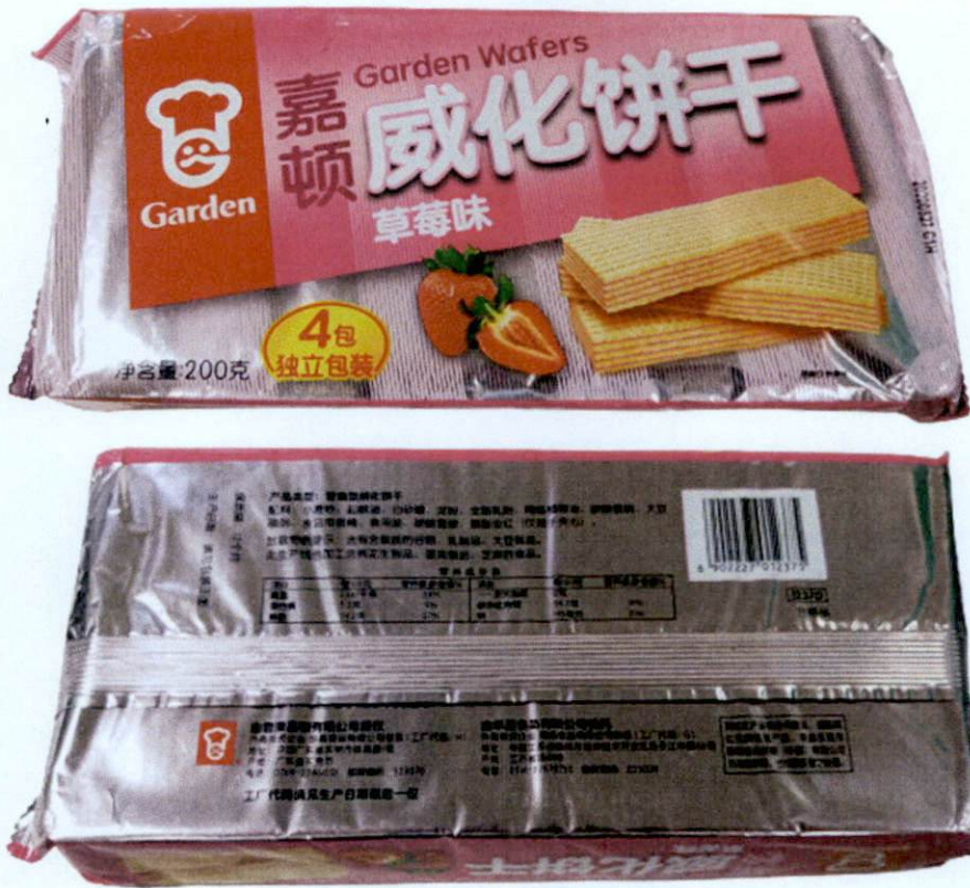
Figure 2. Unregistered GARDEN Garden Wafers in Pink Packaging (In Foreign Language)