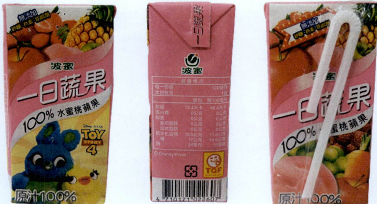
Figure 4. Unregistered Juice Drink in Pink Tetra Pak with Toy Story 4 Character (In Foreign Language)