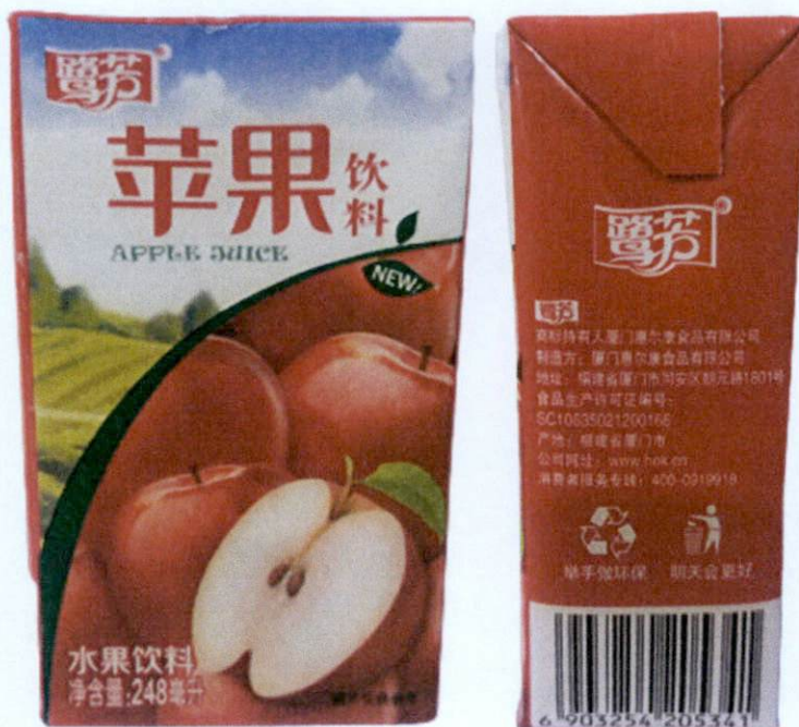
Figure 1. Unregistered Apple Juice in Tetra Pak with Red Apple Image (In Foreign Language)

The Food and Drug Administration (FDA) warns all healthcare professionals and the general public NOT TO PURCHASE AND CONSUME the following unregistered food products: