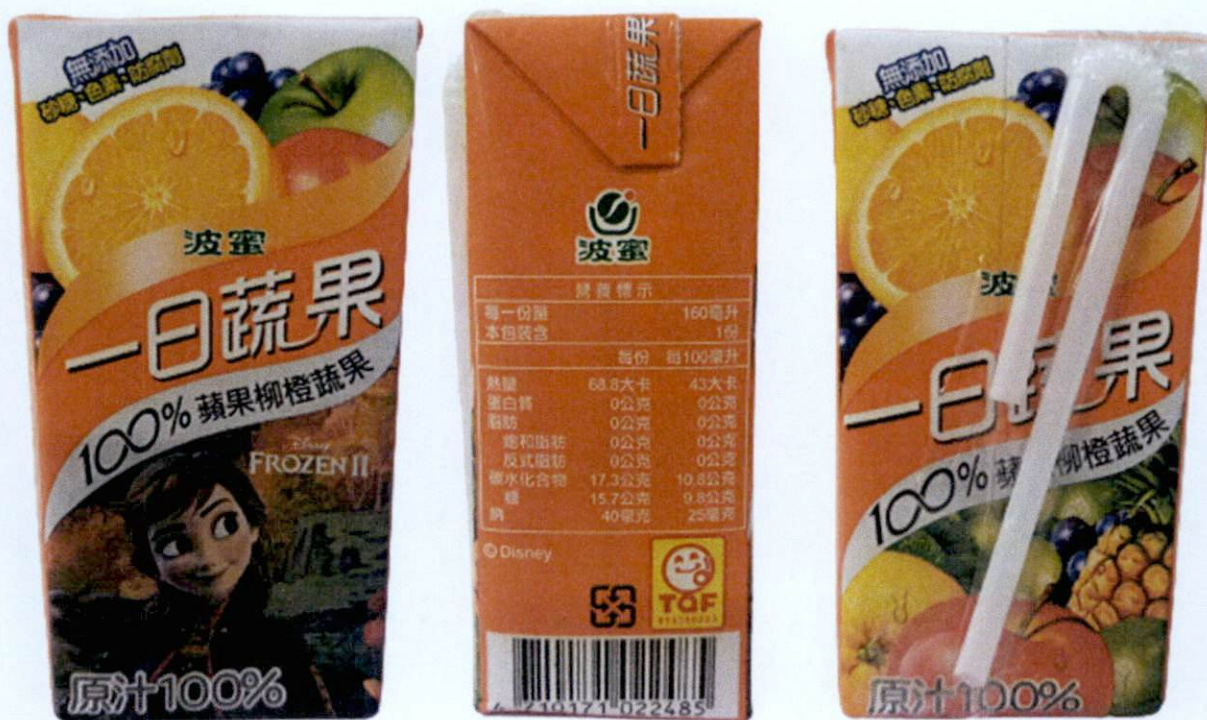
Figure 3. Unregistered Juice Drink in Orange Tetra Pak with Frozen Character (In Foreign Language)