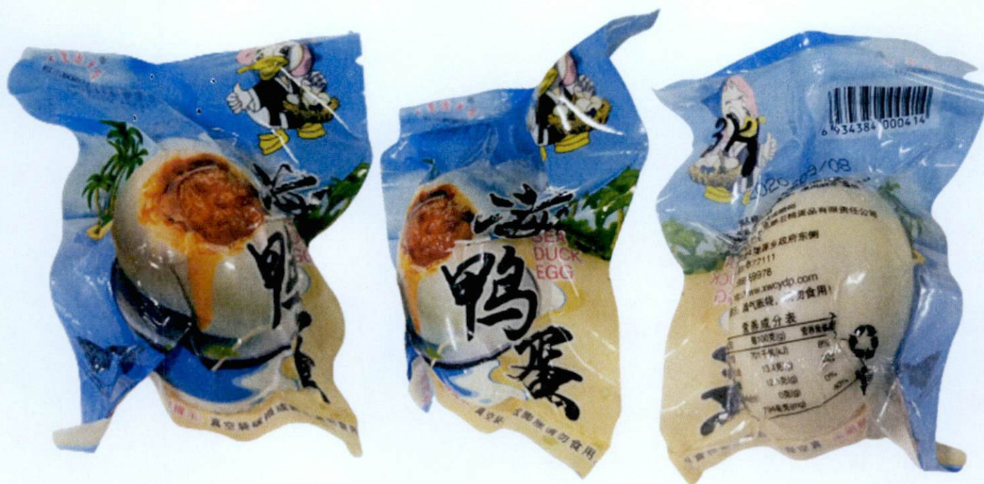
Figure 2. Unregistered Sea Duck Egg in Blue Vacuum Sealed Plastic (In Foreign Language)