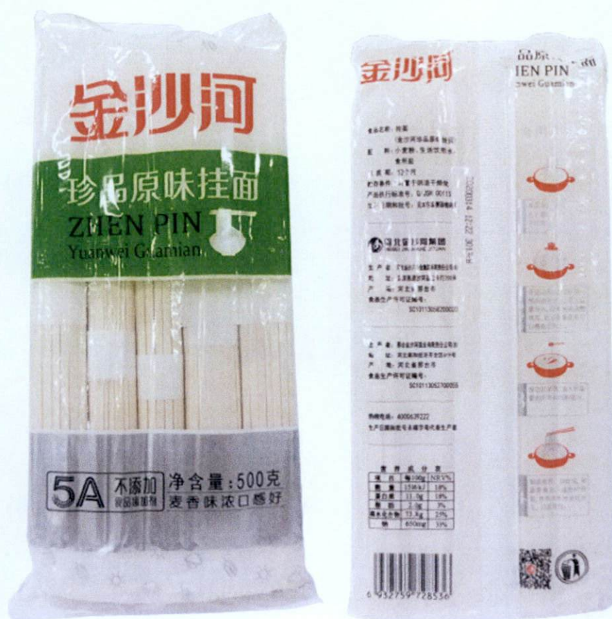
Figure 5. Unregistered ZHEN PIN Yuanwei Guamian Noodles in Green and White Packaging (In Foreign Language)