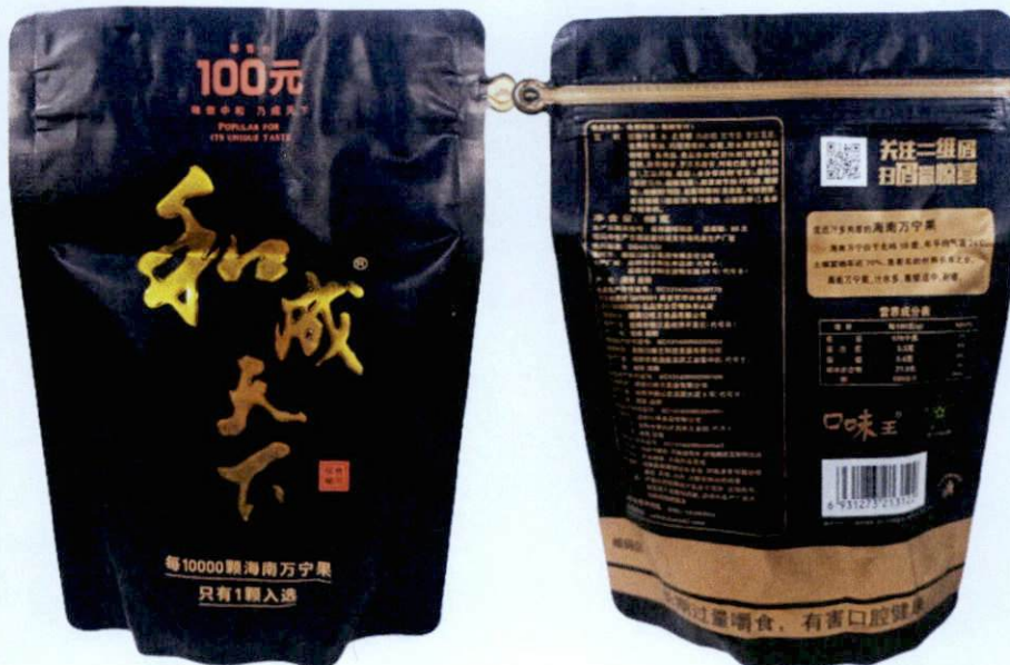
Figure 1. Unregistered 100 Food Product in Dark Blue Pouch with Gold Label (In Foreign Language)

The Food and Drug Administration (FDA) warns all healthcare professionals and the general public NOT TO PURCHASE AND CONSUME the following unregistered food products: