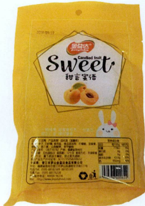
Figure 3. Unregistered JINYIDA Sweet Candied Fruit in Yellow Bag with Image of Bunny and Yellow Peaches (In Foreign Language)