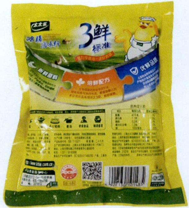
Figure 2. Unregistered Granulated Chicken Bouillon in Yellow Packaging (In Foreign Language)