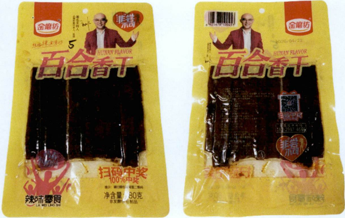
Figure 4. Unregistered LA WEI LING SHI Hunan Flavor in Light Yellow Plastic with Transparent Center and Image of a Man (In Foreign Language)