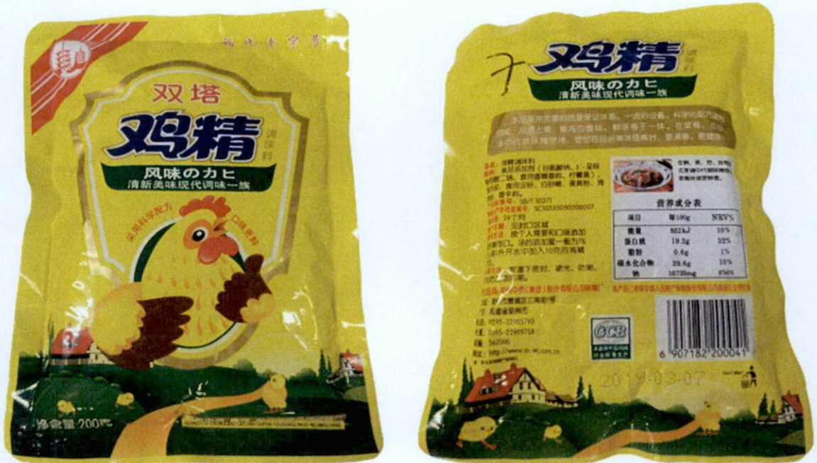
Figure 5. Unregistered Food Product in Yellow Foil Packaging with Image of Rooster (In Foreign Language)