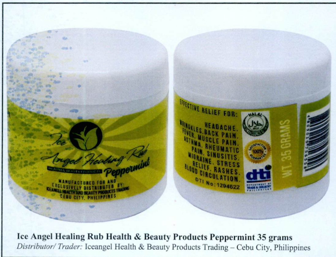
Ice Angel Healing Rub Health & Beauty Products Peppermint 35 grams

The Food and Drug Administration (FDA) advises the public against the purchase and use of the following unregistered drug products: