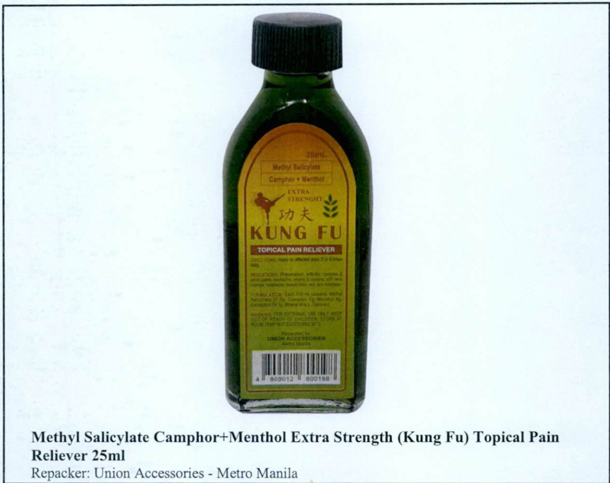
Figure 2. Unregistered drug product

FDA Post-Marketing Surveillance (PMS) activities have verified that the abovementioned drug products have not gone through the registration process of the Agency and have not been issued with proper authorization in the form of Certificate of Product Registration. Thus, the Agency cannot guarantee its quality, safety and efficacy. Therefore, consumption of such violative products may pose potential danger or injury to health.