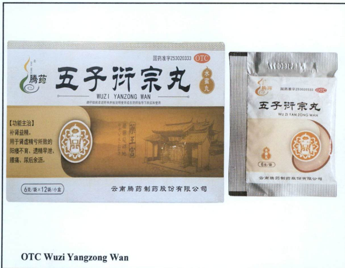
Figure 5. Unregistered drug product