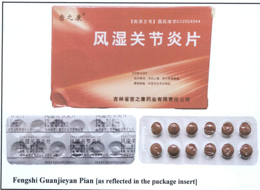
Fengshi Guanjiayan Pian [as reflected in the package insert]

The Food and Drug Administration (FDA) advises the public against the purchase and use of the following unregistered drug products: