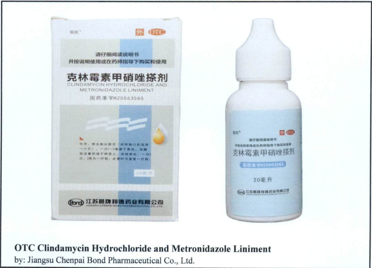
OTC Clindamycin Hydrochloride and Metronidazole Liniment by: Jiangsu Chenpai Bond Pharmaceutical Co., Ltd.