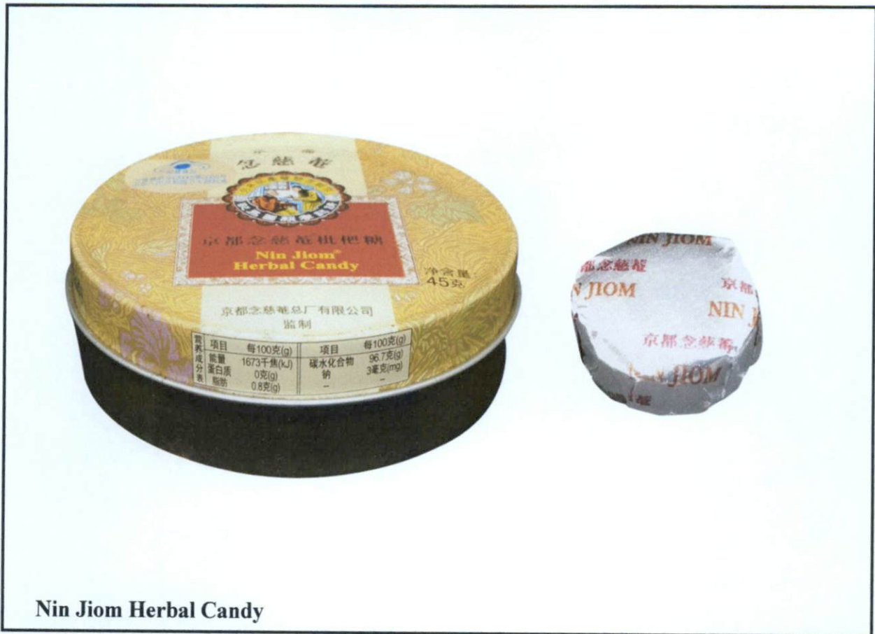
Nin Jiom Herbal Candy