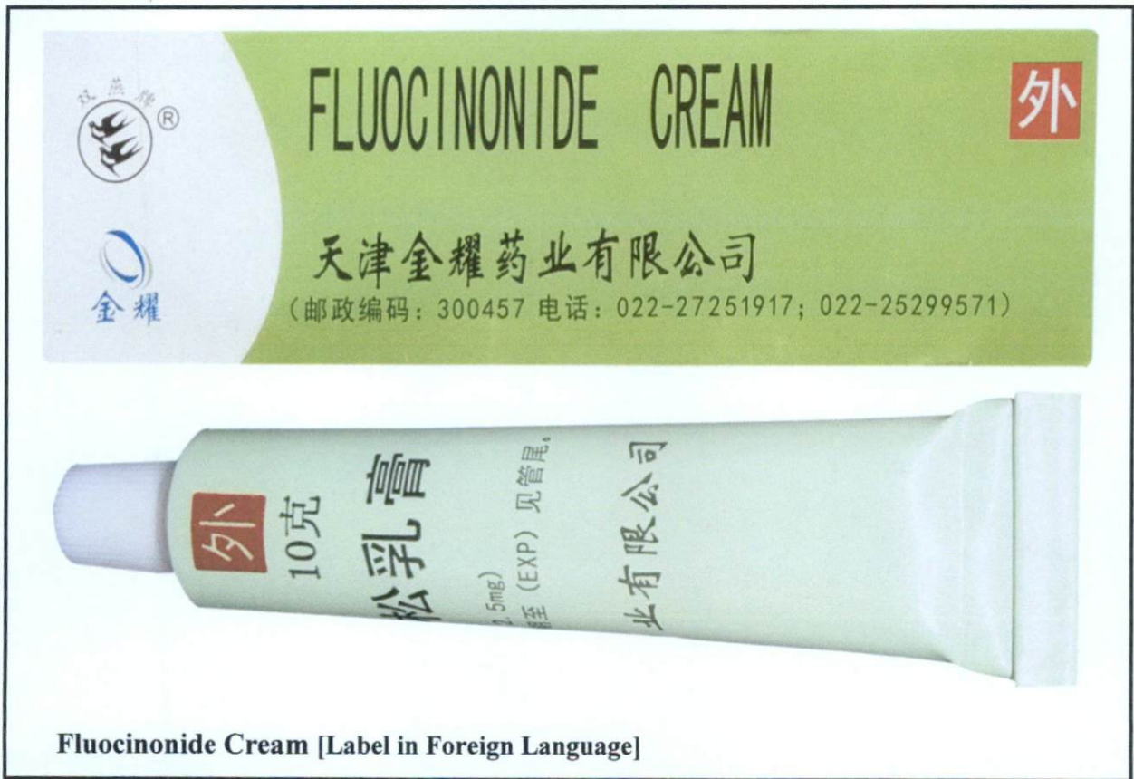
Fluocinonide Cream [Label in Foreign Language]