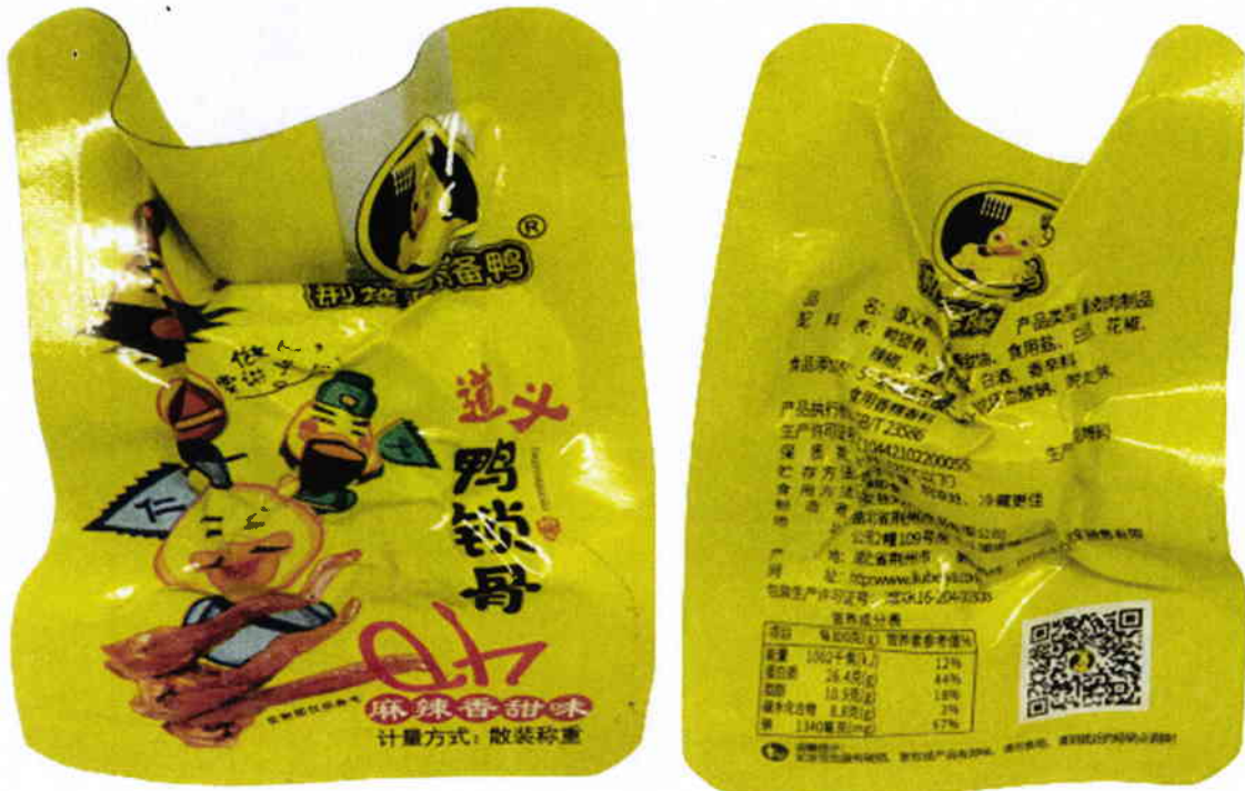
Figure 2. Unregistered DAOYIYASUOGU Duck Feet in Yellow Vacuum Sealed Packaging with Duck Cartoon (In Foreign Language)