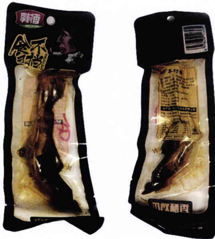
Figure 1. Unregistered SHIBUKEDANG Chicken feet in Black Vacuum Sealed Packaging (In Foreign Language)

The Food and Drug Administration (FDA) warns all healthcare professionals and the general public NOT TO PURCHASE AND CONSUME the following unregistered food products and food supplement: