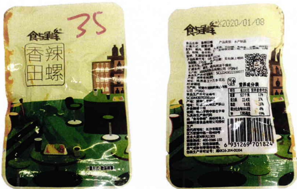
Figure 3. Unregistered Food Product in Light-yellow green Vacuum Sealed Packaging (In Foreign Language)