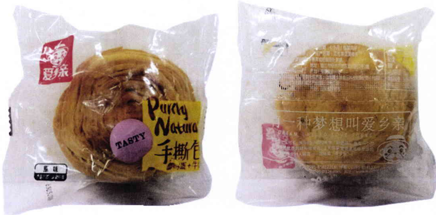
Figure 3. Unregistered TASTY PURELY NATURAL Bread in Transparent Packaging (In Foreign Language)