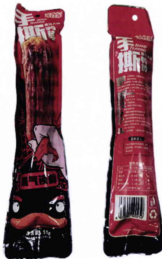
Figure 5. Unregistered Hand Tearing Food Product with Image of Sausage in Red and Black Packaging (In Foreign Language)