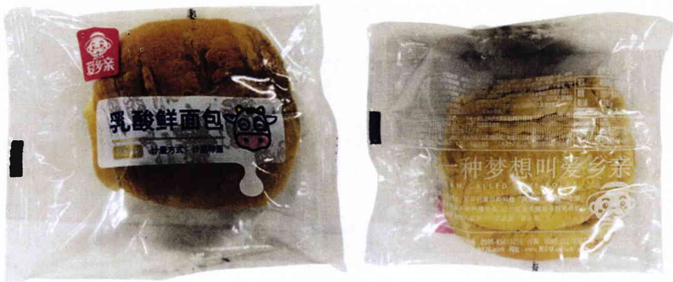
Figure 2. Unregistered Bread with Cow Image and White Label in Transparent Packaging (In Foreign Language)