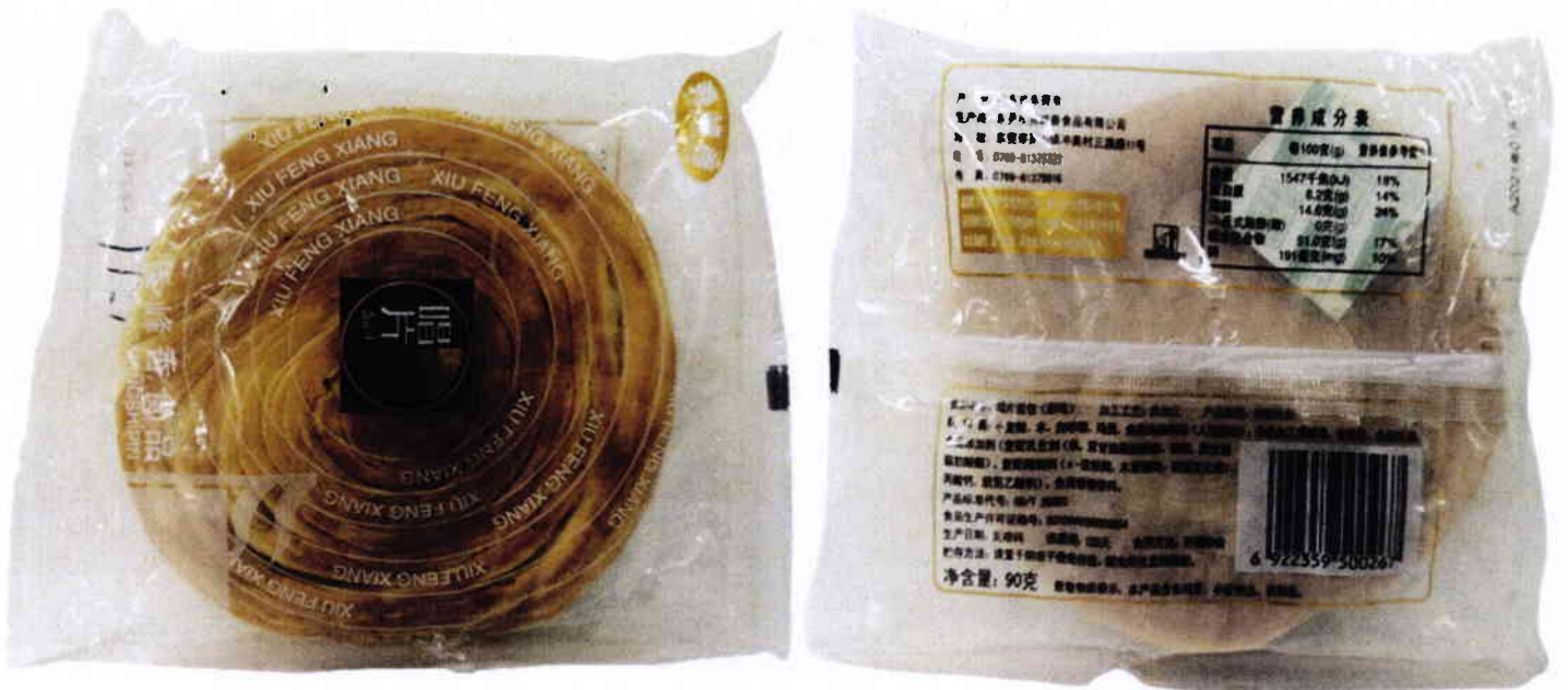
Figure 4. Unregistered XIU FENG XIANG Bread in Transparent Packaging (In Foreign Language)