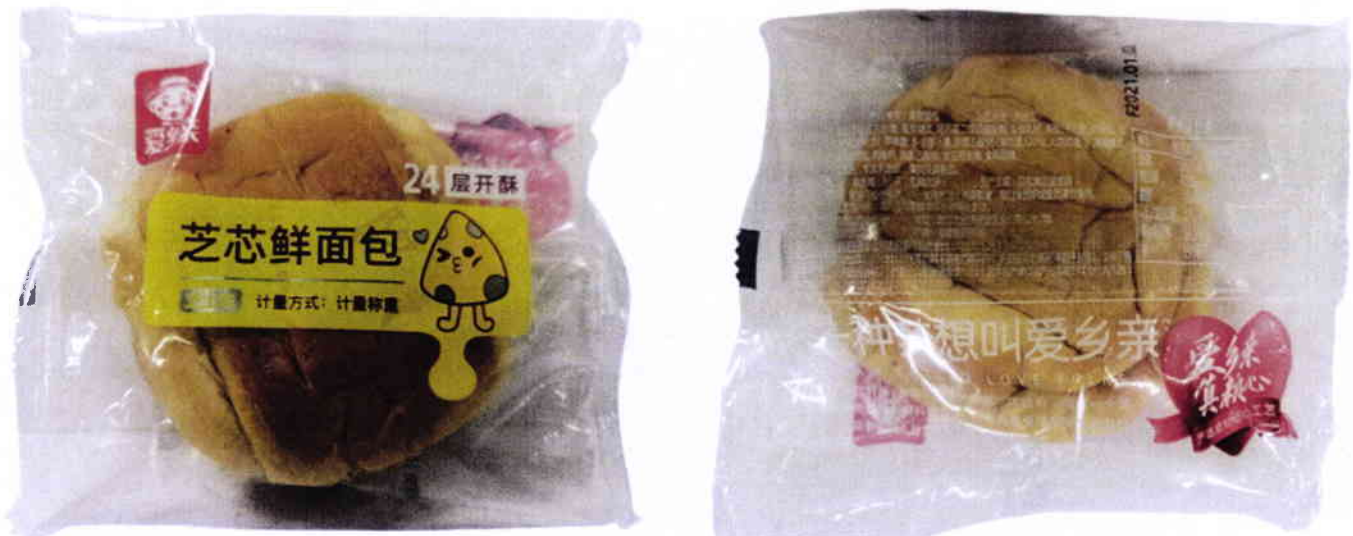
Figure 1. Unregistered Bread with Cheese Image and Yellow Label in Transparent Packaging (In Foreign Language)

The Food and Drug Administration (FDA) warns all healthcare professionals and the general public NOT TO PURCHASE AND CONSUME the following unregistered food products: