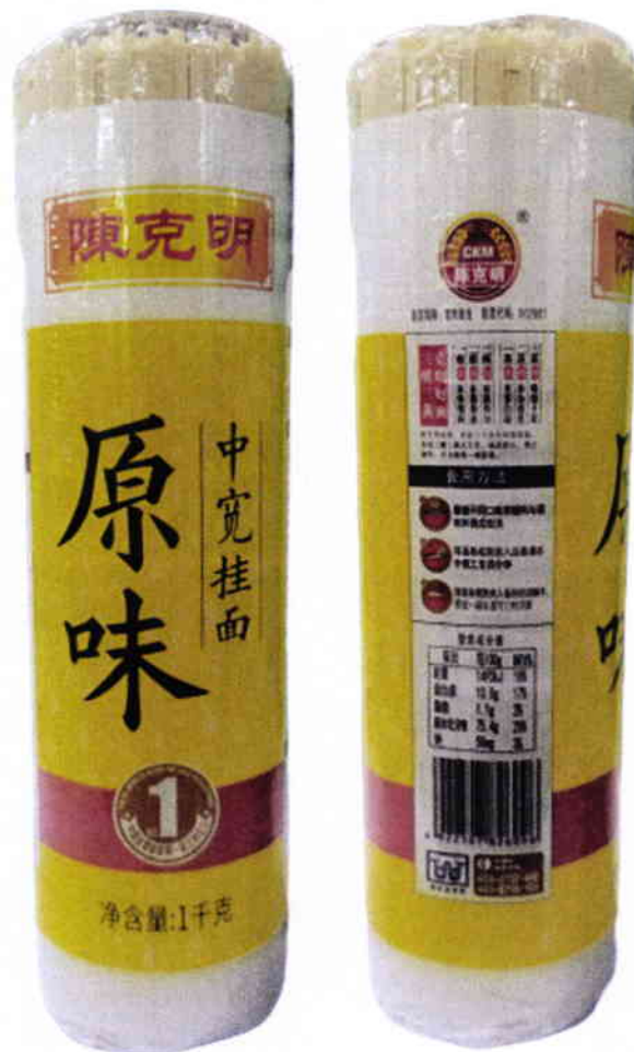
Figure 3. Unregistered Noodles in Yellow and Transparent Packaging (In Foreign Language)