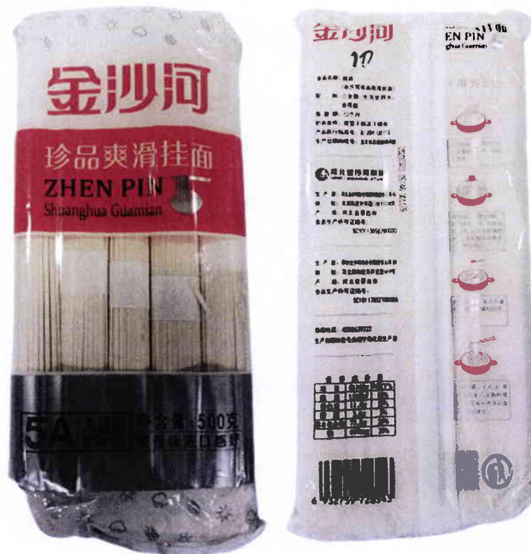
Figure 5. Unregistered ZHEN PIN Shuanghua Guamian Noodles in Red and White Packaging (In Foreign Language)