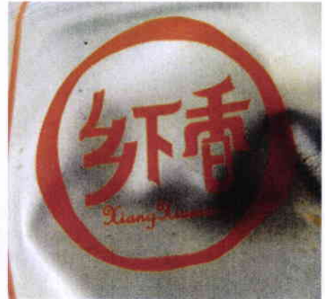
Figure 2. Unregistered Xiang Xiayang Food Product in Silver Vacuum Sealed Packaging (In Foreign Language)