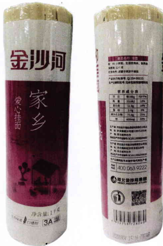
Figure 4. Unregistered Noodles in Pink and Transparent Packaging (In Foreign Language)