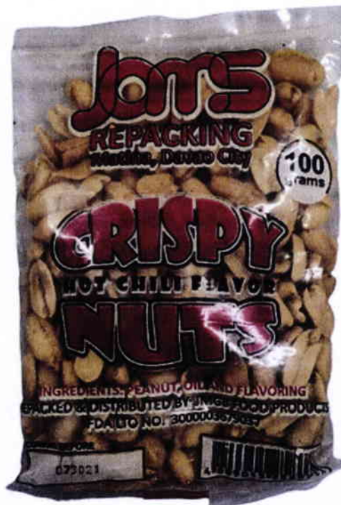
Figure 5. Unregistered JAMS REPACKING Crispy Nuts Hot Chili Flavor