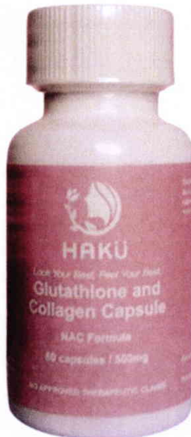
Figure 1. Unregistered HAKU Glutathione and Collagen Capsule

The Food and Drug Administration (FDA) warns all healthcare professionals and the general public NOT TO PURCHASE AND CONSUME the following unregistered food supplement and food products: