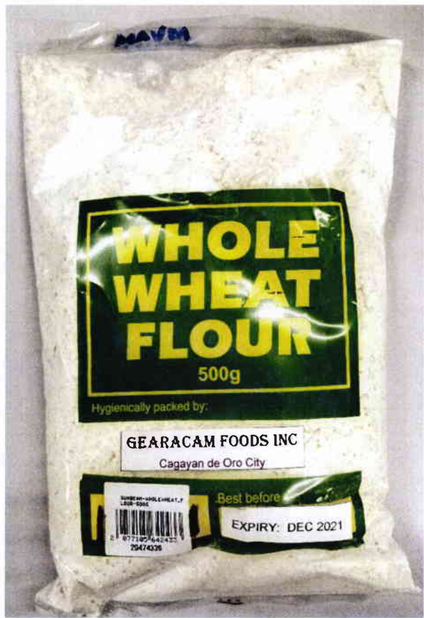
Figure 2. Unregistered SUNBEAM Whole Wheat Flour