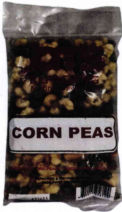
Figure 4. Unregistered JAMS REPACKING Corn Peas