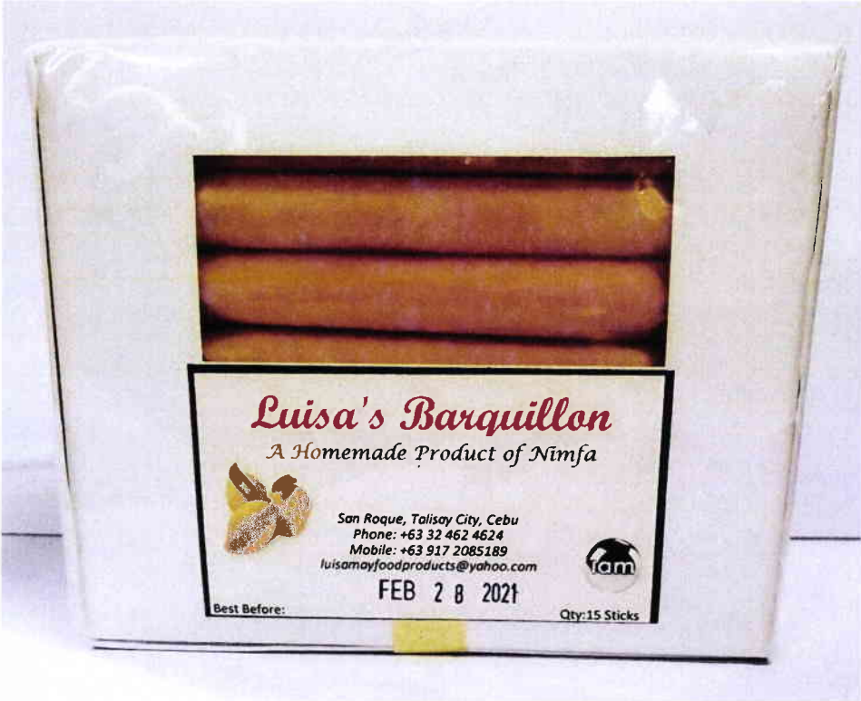
Figure 3. Unregistered LUISA'S Barquillon