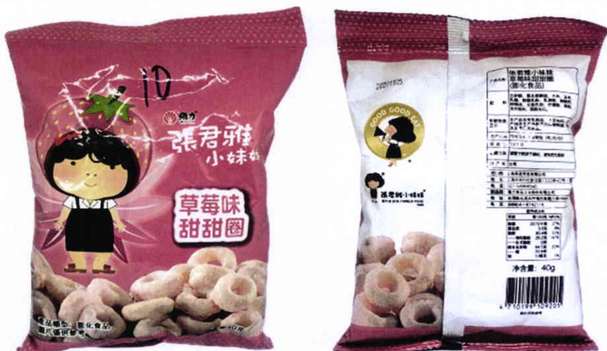
Figure 1. Unregistered WEI LIH Donut-Shaped Food in Pink Laminated Foil Pouch (In Foreign Language)

The Food and Drug Administration (FDA) warns all healthcare professionals and the general public NOT TO PURCHASE AND CONSUME the following unregistered food products: