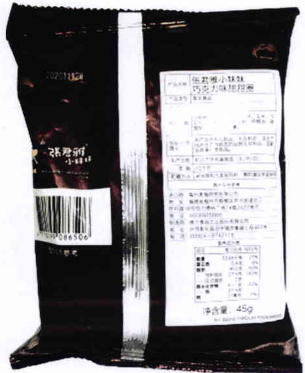
Figure 2. Unregistered WEI LIH Donut-Shaped Food in Brown Laminated Foil Pouch (In Foreign Language)