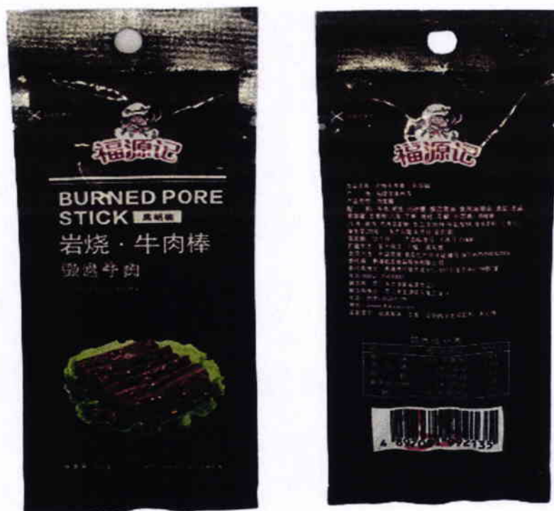
Figure 5. Unregistered BURNED PORE STICK Selection of Pork in Brown Vacuum Sealed Packaging (In Foreign Language)