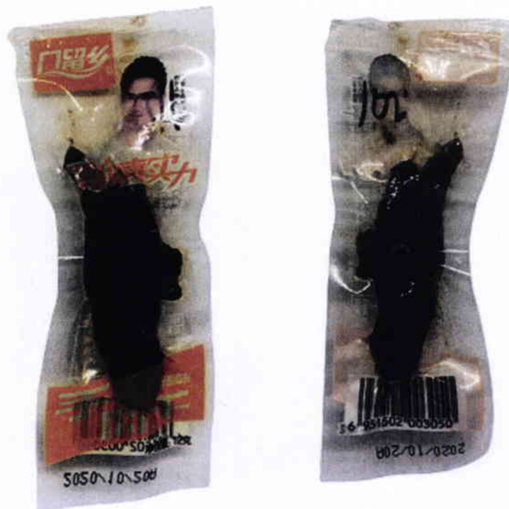
Figure 3. Unregistered Preserved Meat Product in Transparent Orange Vacuum Sealed Packaging with Image of Man (In Foreign Language)