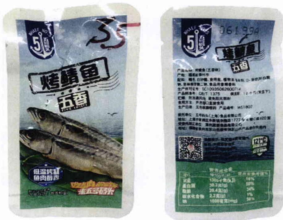
Figure 4. Unregistered WHAEF NO. 5 Five Spices in Vacuum Sealed Packaging with Fish Image (In Foreign Language)