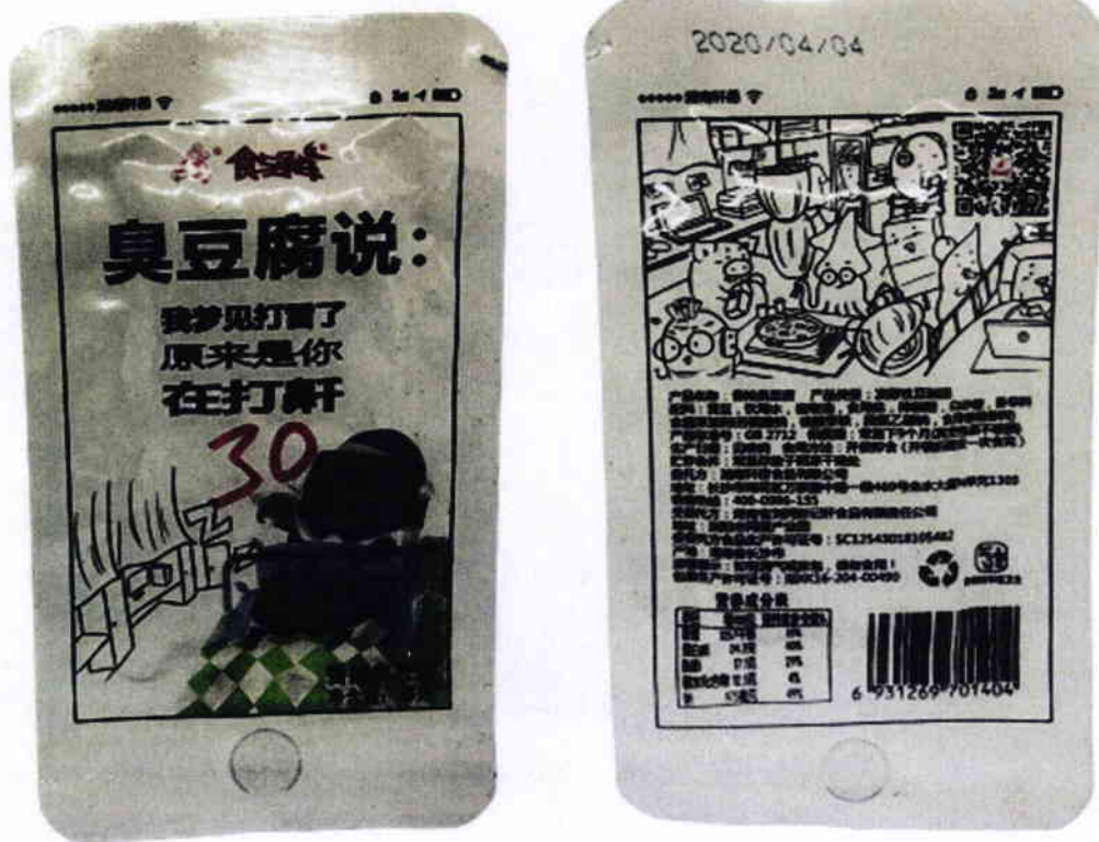
Figure 2. Unregistered Food product in White Packaging with Sleeping Cartoons (In Foreign language)