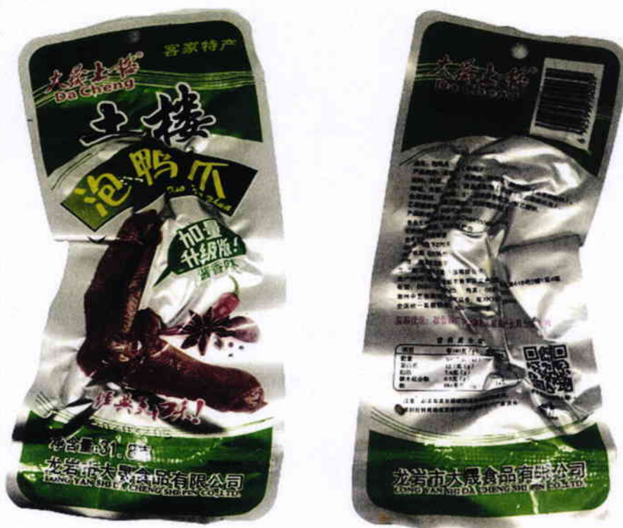
Figure 4. Unregistered DA CHENG PAO YA ZHUA Chicken Feet with Star Anise and Chili in Grey and Green Vacuum Sealed Packaging (In Foreign Language)