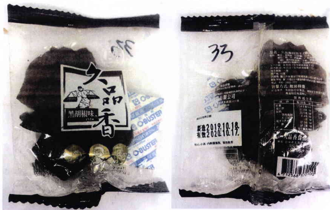
Figure 5. Unregistered Preserved Meat Product in Transparent Packaging with Brown Lining (In Foreign Language)