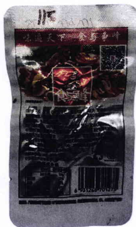
Figure 3. Unregistered Food product in White and Orange Vacuum Sealed Packaging with Chef Image (In Foreign Language)