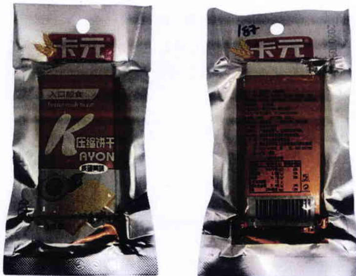
Figure 1. Unregistered KAYON Instant Ready to Eat Tofu with Salted Egg Image in Silver and Brown Vacuum Sealed Packaging (In Foreign Language)

The Food and Drug Administration (FDA) warns all healthcare professionals and the general public NOT TO PURCHASE AND CONSUME the following unregistered food products: