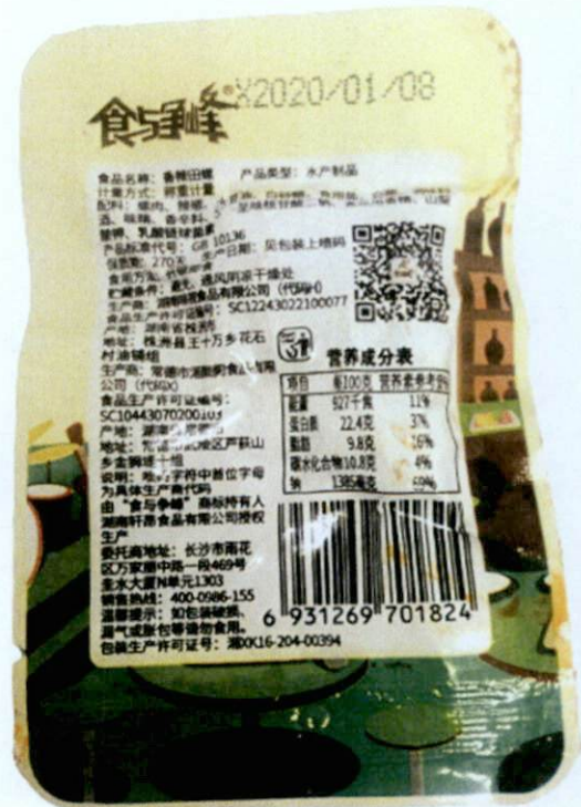
Figure 3. Unregistered Food Product in Light-yellow green Vacuum Sealed Packaging (In Foreign Language)