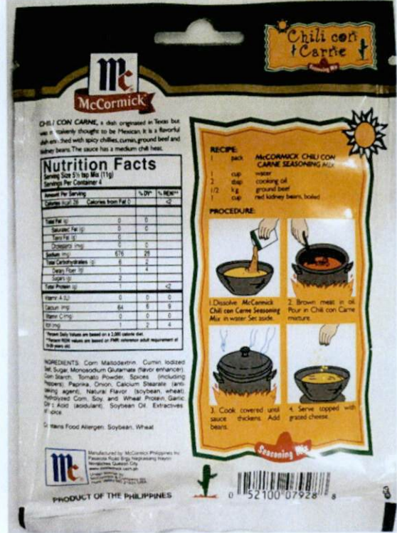
Figure 2. Unregistered MCCORMICK Chili Con Carne Seasoning Mix