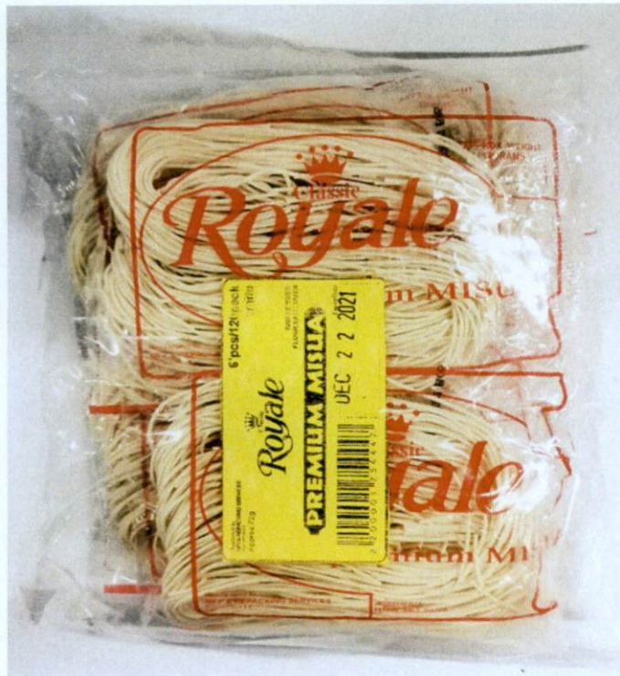
Figure 4. Unregistered CLASSIC ROYALE Premium Misua