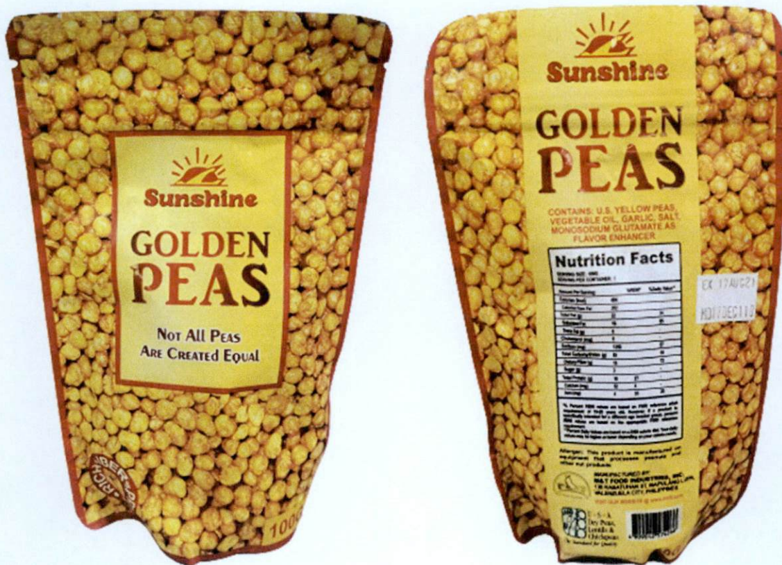
Figure 5. Unregistered SUNSHINE Golden Peas