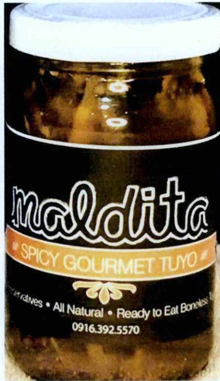
Figure 2. Unregistered MALDITA Spicy Gourmet Tuyo