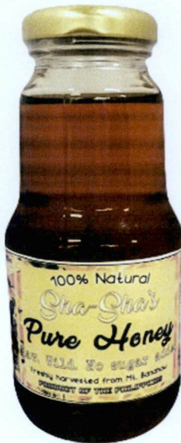
Figure 3. Unregistered SHA-SHA'S Pure Honey