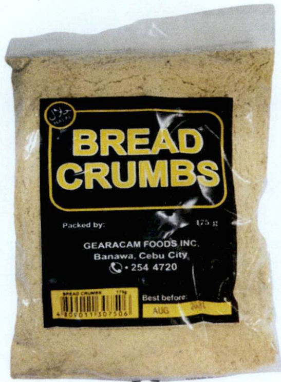
Figure 4. Unregistered GEARACAM FOODS Breadcrumbs