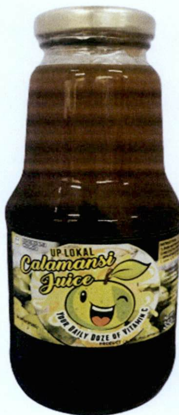
Figure 3. Unregistered UP LOKAL Calamansi Juice