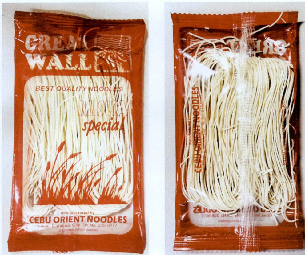
Figure 2. Unregistered GREAT WALL Misua Special