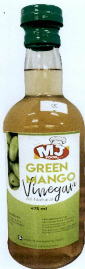
Figure 4. Unregistered MJ FOOD Green Mango All Natural Vinegar