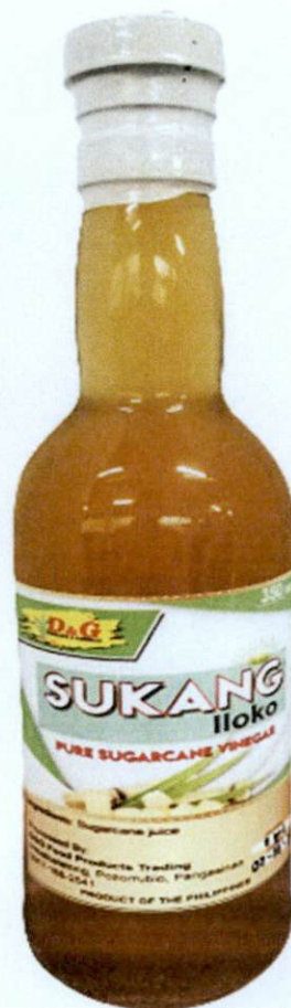
Figure 5. Unregistered D & G Sukang Iloko Pure Sugarcane Vinegar

The FDA verified through online monitoring or post-marketing surveillance that the abovementioned food supplement and food products are not registered and no corresponding Certificates of Product Registration (CPR) have been issued. Pursuant to the Republic Act No. 9711, otherwise known as the “Food and Drug Administration Act of 2009”, the manufacture, importation, exportation, sale, offering for sale, distribution, transfer, non-consumer use, promotion, advertising or sponsorship of health products without the proper authorization is prohibited.