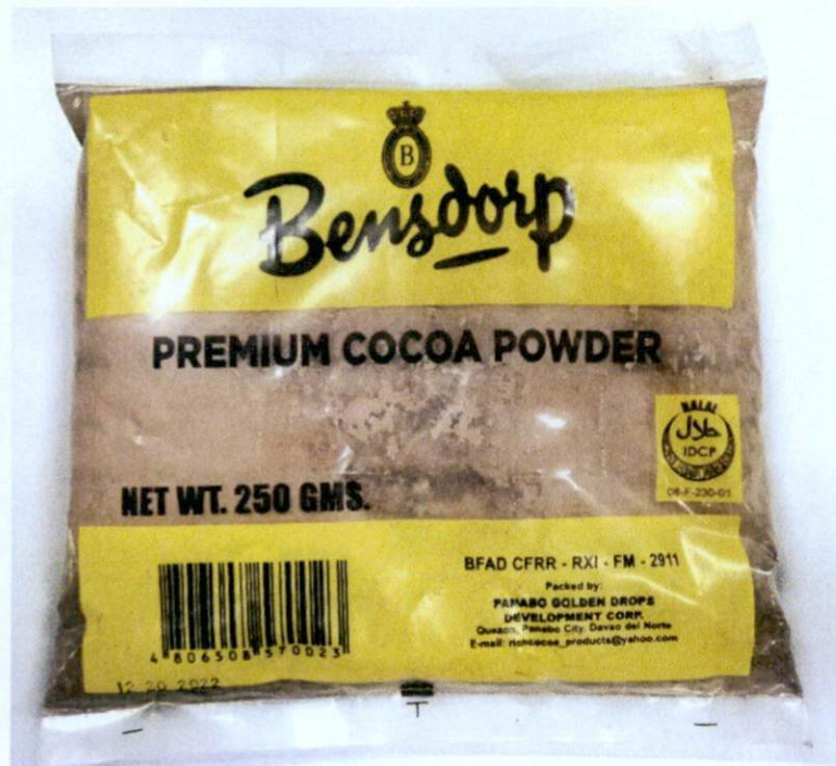
Figure 1. Unregistered BENSDORP Premium Cocoa Powder

The Food and Drug Administration (FDA) warns all healthcare professionals and the general public NOT TO PURCHASE AND CONSUME the following unregistered food products and food supplement: