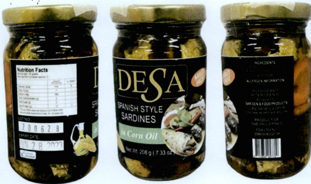
Figure 4. Unregistered DESA Spanish Style Sardines in Corn Oil- Mild Hot