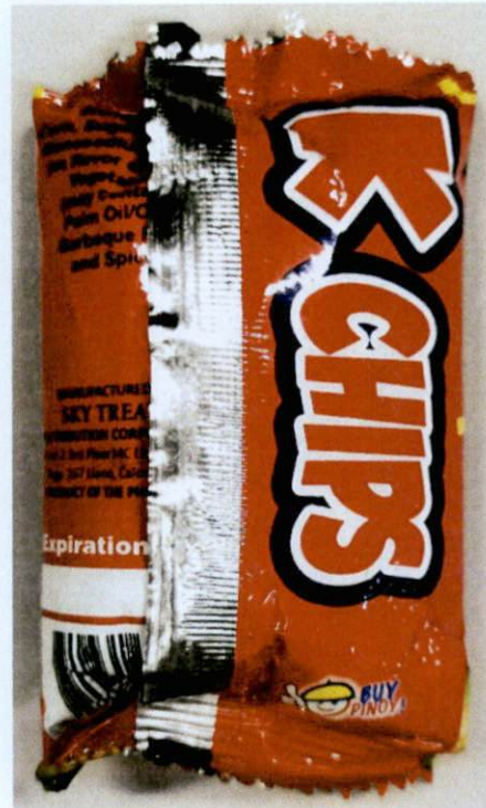
Figure 2. Unregistered K CHIPS Corn Chips BBQ Flavor