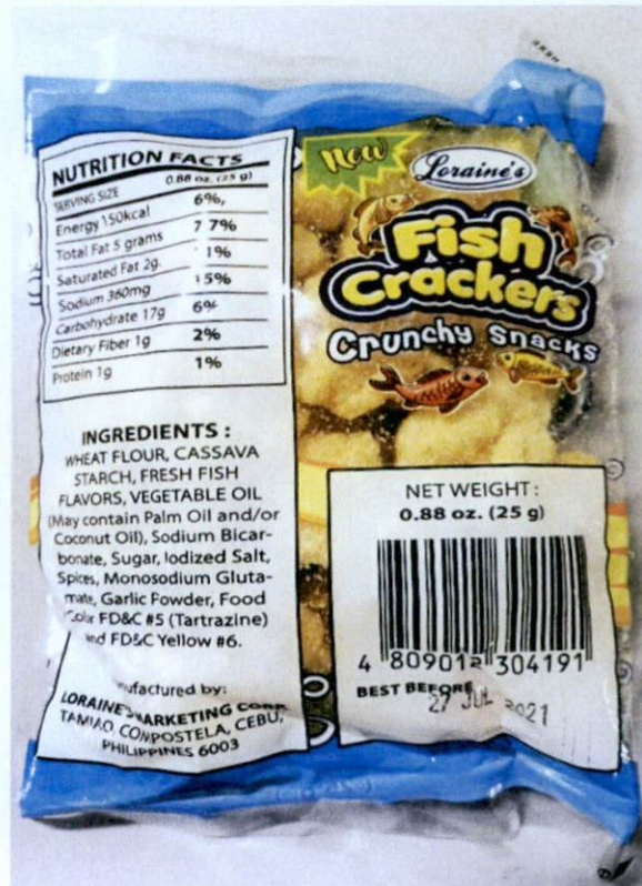
Figure 3. Unregistered LORAINÉ'S Fish Crackers