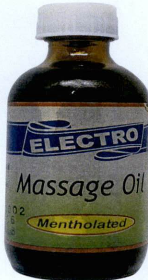
Electro Massage Oil 60ml Manufactured by: Ellestreque Pharmaceutical and Industrial Corporation