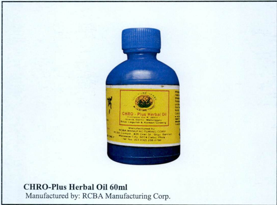
Figure 5. Unregistered drug product