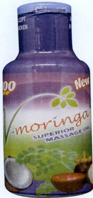
New Moringa™ Superior Massage Oil 60ml Manufactured by: V-Moringa Herbal Products