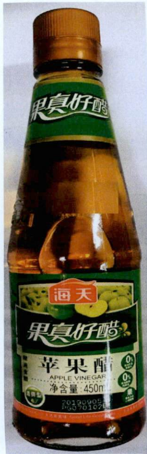
Figure 2. Unregistered Apple Vinegar in Glass Bottle (in foreign language, Barcode:6902265608011)