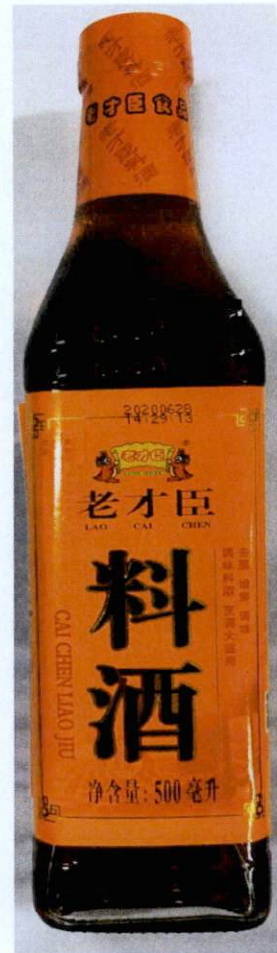
Figure 3. Unregistered LAO CAI CHEN Cai Chen Liao Jiu in reddish clear liquid (in foreign language, barcode: 6930628800383)