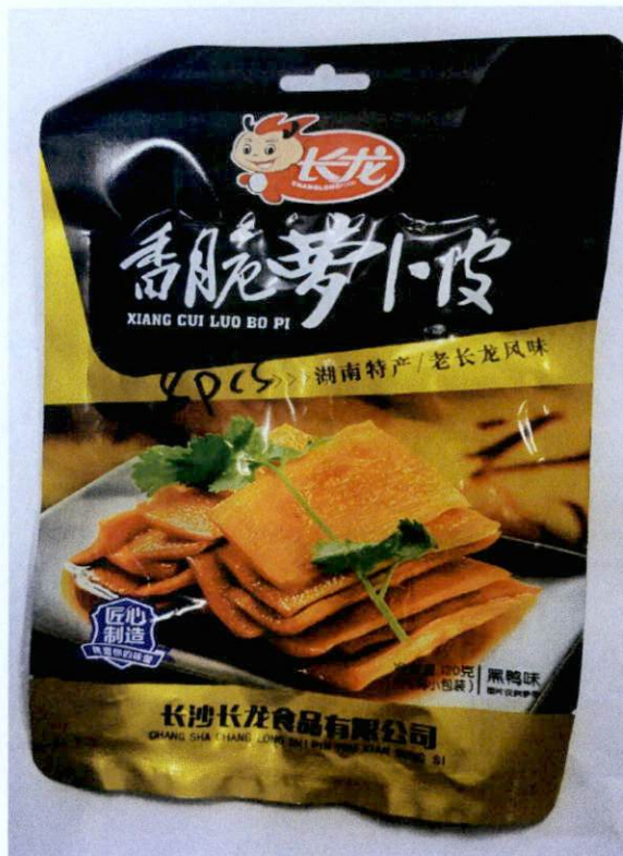
Figure 1. Unregistered CHANGLONG FOOD Xiang Cui Luo Bo Pi (in foreign language, barcode: 6952675370510)

The Food and Drug Administration (FDA) warns all healthcare professionals and the general public NOT TO PURCHASE AND CONSUME the following unregistered food products: