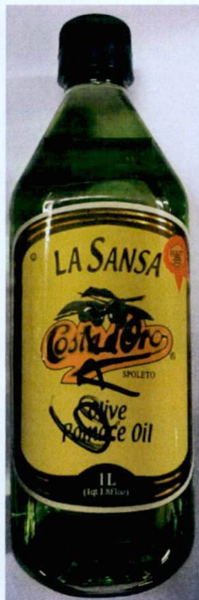
Figure 4. Unregistered LA SANSA Cota d' Oro Olive Pomace Oil, 1L