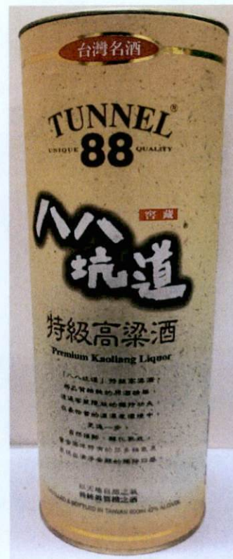
Figure 3. Unregistered TUNNEL 88 Premium Kaoliang Liquor, in beige canister (in foreign language, BarCode: 4715309030295)