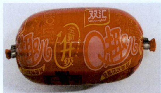
Figure 5. Unregistered SHUANGHUI (red sausage-like product in plastic) (in foreign language, barcode: 6902890233916)