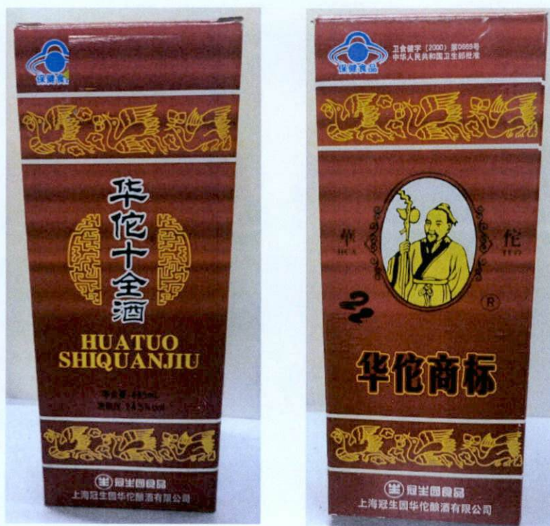
Figure 1. Unregistered HUATUO SHIQUANJIU 445 mL; 24.5% vol in red box (in foreign language, barcode: 6936449810075)

The Food and Drug Administration (FDA) warns all healthcare professionals and the general public NOT TO PURCHASE AND CONSUME the following unregistered food products: