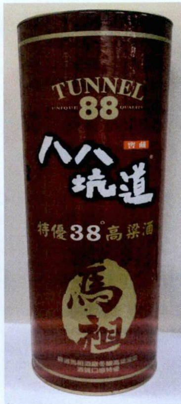
Figure 2. Unregistered TUNNEL 88 in red canister (in foreign language, BarCode: 4715309031216)